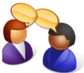
Figure 2 Differences between the EHC planning and SEN Statementing pathways