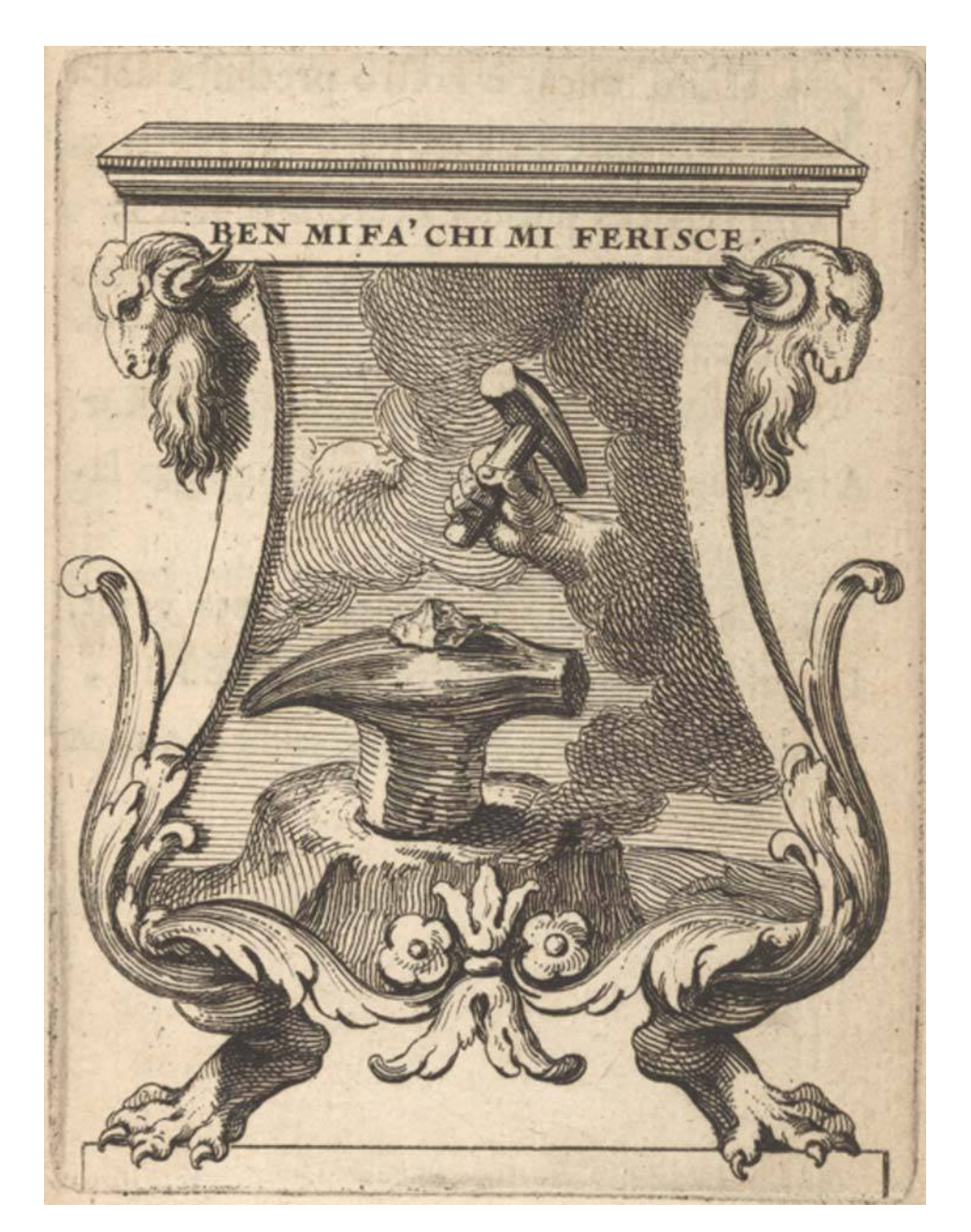
FIGURE 3 Diamond. Le Triomphe de la Religion sous Louis le Grand: représenté par des inscriptions et des devises: avec une explication en vers latins et François. 1687. p.99 Engraving.

General Research Division, The New York Public Library, Astor, Lenox and Tilden Foundations