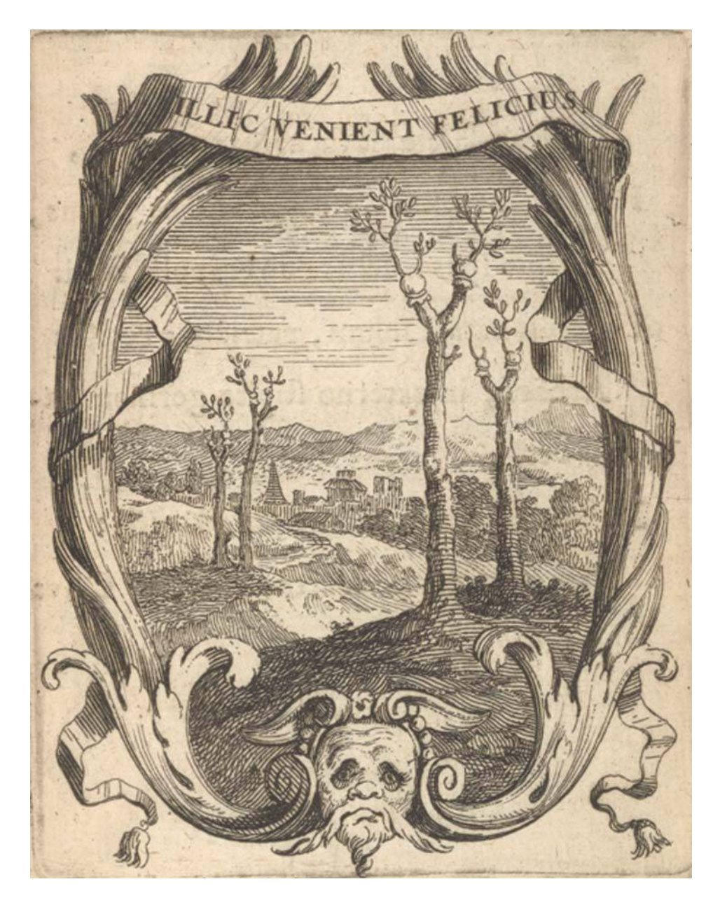
FIGURE 2 Seedling. Le Triomphe de la Religion sous Louis le Grand: représenté par des inscriptions et des devises: avec une explication en vers latins et François. 1687. p.65 Engraving.