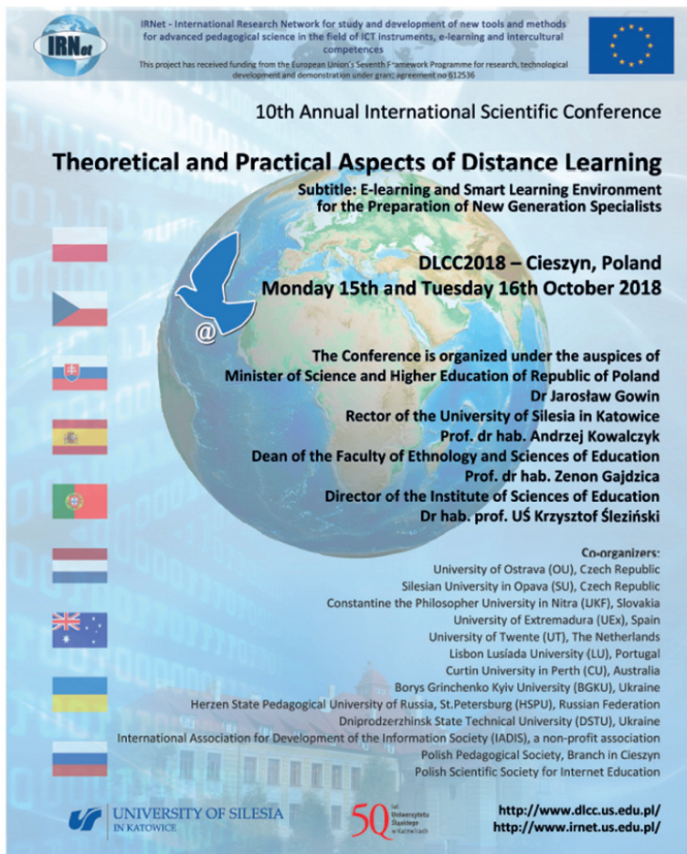
Figure 1. Poster of the DLCC2018 Conference ( www.dlcc.us.edu.pl )