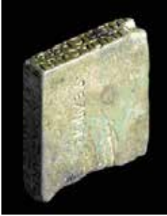
Figure 1. Collyria seal found in Kenchester (Herefordshire).

Over the past four centuries archaeologists discovered several small stone pieces with prescriptions by eye doctors, known as collyria (Latin name for ointments, suppositories, or medicinal liquids) [1] seals or stamps. The discoveries were made at different sites all over the territory that once belonged to the ancient Roman Empire (Fig. 1).