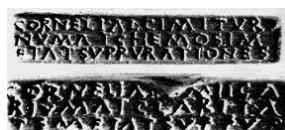
Figure 4. Collyria seal from Cauca (Coca, Segovia, Spain)

This collyria seal is the most recent discovery in the Iberian Peninsula. Discovered in 1974, it is dated to the turn of the 3rd century [15]. It was found by chance among the ruins of the ancient Cauca and is currently kept in the Museum of Segovia (Spain). Before that, it belonged to the private collection of Jesús Hedo in Arévalo (Ávila, Spain) (Fig. 4). It is made of quartzite and its dimensions are 40x20x8 mm. It has a rectangular shape with inscriptions only on its longer narrow sides (Table 3).