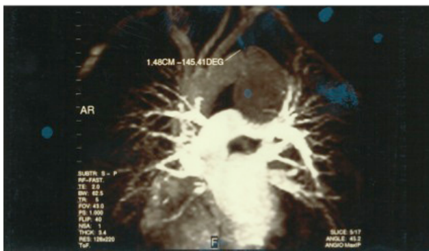
Figure 1: Angio MRI: presence of pseudo-aneurysm of the descending thoracic aorta compressing the bronchus of the left and probably the left recurrent nerve. At the level of the origin of the descending thoracic enjoying a break from the intima closed chest trauma.

The association of vocal cord dysfunction with thoracic aortic aneurysm has been reported in the cardiovascular and otolaryngologic literature [4,5,6,8,21-23]. The recurrent laryngeal nerve in its course from the brain stem to the larynx follows a path that brings it in proximity to numerous structures. These structures can interfere with its function by pressure or by disruption of the nerve caused by disease invading the nerve. Indeed, a recurrent laryngeal nerve paralysis can be related to multiple causes. Malignant neoplasms of the lung and pulmonary tuberculosis are most frequent causes of the paralysis. Idiopathic paralysis are also very frequent; paralysis caused by thyroid surgery [2,3] and endotracheal intubation come next. Ortner’s syndrome [4], also known as cardiovocal syndrome, is a rare clinical entity that is manifested by hoarseness due to left recurrent laryngeal nerve palsy secondary to cardiovascular disease. Thoracic aortic aneurysms are usually asymptomatic [24,25]. In a retrospective