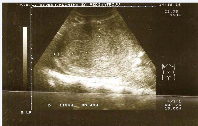
Figure 1 Abdominal ultrasound suggestive of heterogeneous liver lesion, measuring 12x8 cm.

The girl is regularly followed-up clinically and with imaging studies. Seven years after the diagnosis she is in complete