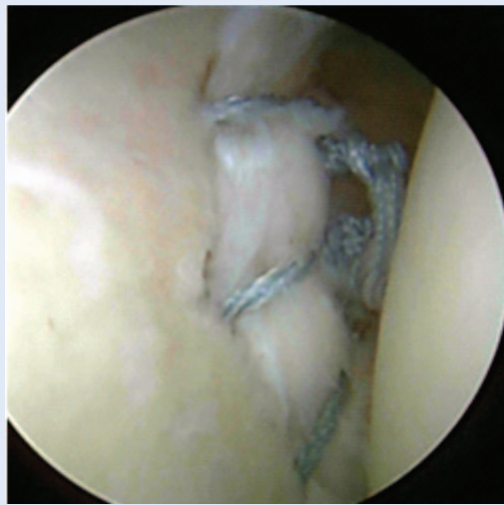
Figure 1. Arthroscopic image of the labrum repair

exam. The range of motion in the instable shoulder should be compared to the contralateral side. Instability tests will give us more information on the grade of instability. After clinical evaluation, a variety of imaging procedures can be used to determine the shoulder pathology. Among them, standard and special X-rays are basic. Sometimes we include ultrasonography or MRI to establish the soft tissue status. (Figures 2 and 3). The results of arthroscopic Bankart repair are generally very good 2,5,7 . The redislocation rate is reported to be between 6 % and 25 %, depending on the author's experience. A meta-analysis of comparing arthroscopic and open repair showed similar recurrence rates (6 % in arthroscopic and 6.7 % in open repair) 12 . In the second part of the study, after a longer follow-up, the reoperation rate was even bigger in the open group (9.2 %) than in the arthroscopic group (2.2 %). This report indicates that arthroscopic stabilization is a reliable method. Indications for arthroscopic Bankart repair are: 3-5 redislocations, well-defined anterior labrum and absence of bony defect on the humeral head or glenoid rim 13 .