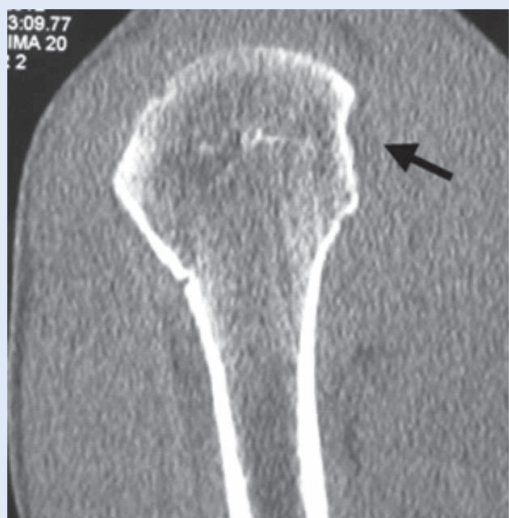
Figure 2. MRI showing the defect on the humeral head (Hill Sachs lesion)