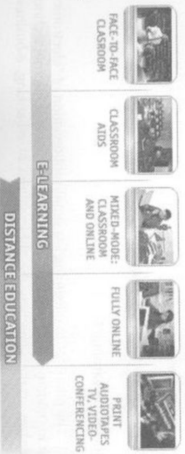
Figure 1. Modalities of teaching and learning with respect to the use of ICT

The modalities are additionally explained in Table 1 where also the usual delivery modes are stated for every mode.