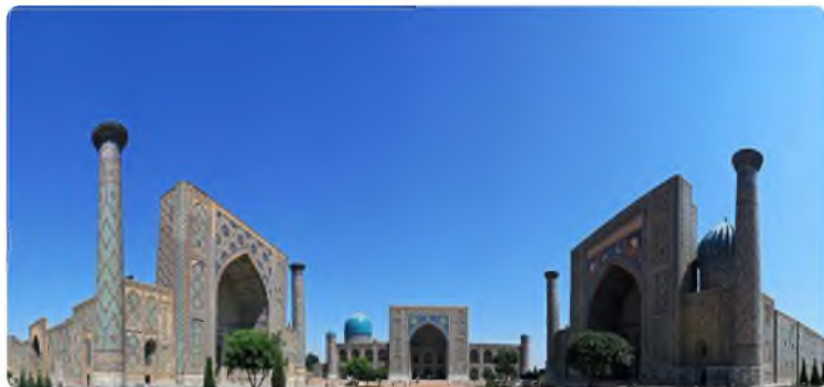
The Registan Square in Samarkand, Uzbekistan with its three famous madrasas from left to right: The Ulugh Beg Madrasah (1417–1420), the Tilla-Kari Madrasah (1646–1660) and the Sher-Dar Madrasa (1619–1636).

educate us well. A book by Tom Bottomore, Sociology: A Guide to Problems & Literature , on the sociology of education, was eye-opening. He wrote that educational institutions in the non-Western world lack academic purpose: their purpose is only to modernize and Westernize the populations of their countries. I realized that our educational institutions were guilty of this, and were indeed created to modernize and Westernize young people rather than academically educate them. And they had achieved their purpose: even though they failed academically,