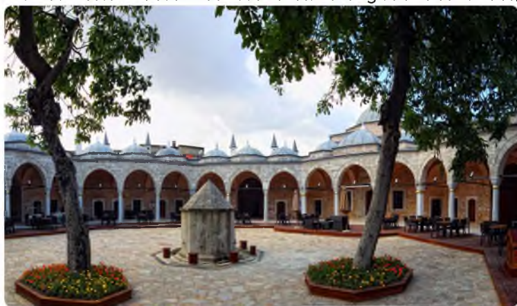
Rüstem Paşa Madrasa in Istanbul, Turkey built by the Grand Vizier of Süleyman the Magnificent, Rüstem Pasha between 1550-1551.

The outcome of this process is what I call “sustainable intellectual dependency,” and this truly is the purpose of universities in the non-Western world: not to raise great scientists, but to make those countries intellectually and academically dependent on the West. Just as we are technologically dependent, importing technological products from the West – airplanes, telephones, weapons, cosmetics, etc. – rather than producing them ourselves, we are intellectually dependent, taught that we cannot produce new ideas: the best we can strive for is to become a good student of Western academics and market Western ideas in our countries. As long as this continues,