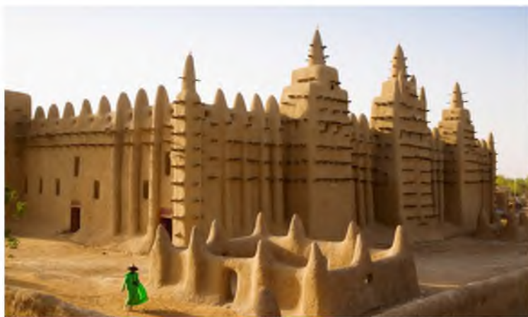
University of Timbuktu / Mali (12th century)

“Nothing.” I tell them that our job advertises itself. Our students at the Alliance of Civilizations Institute are happy with the education they are receiving, so they are our ambassadors to the world. You cannot pay money to random people to better advertise your effort globally, but at the Alliance of Civilizations (ACI) – and now at IHU – we have American, Russian, French, Arab, Dutch and Japanese ambassadors, ambassadors from over 40 countries that promote our institute. It is a powerful way of advertising. Ibn Khaldun University will be the expanded version of what we are doing here at the Alliance of Civilizations Institute, so it is a great opportunity for us to expand on what was a small experiment at the ACI.