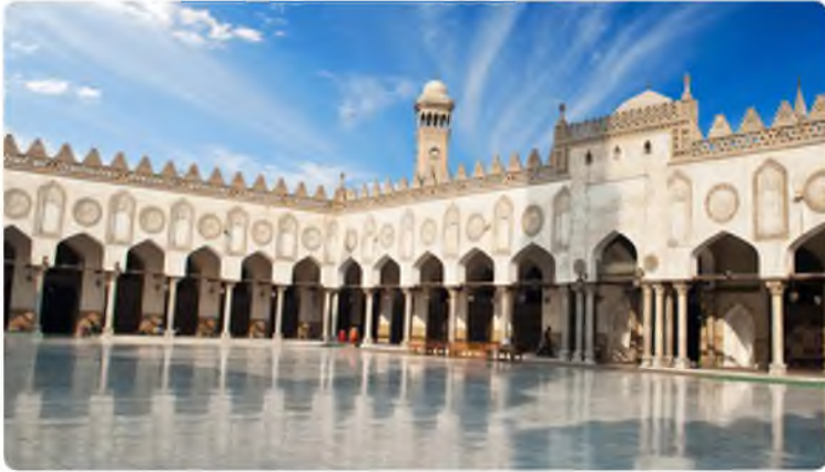
Al-Azhar University in Cairo, Egypt. Established in 970 it is one of the most prestigious institutions of traditional Islamic learning.

kâmil – then it is an Islamic university. If a university teaches how to think as a Muslim and how to produce ideas which are compatible with the Islamic knowledge tradition, then it is an Islamic university.