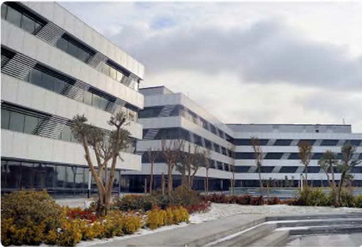
Main Campus of Ibn Khaldun University

The rise of modern universities, though, disrupted this standardized curriculum. The consequences of the shift in the Muslim world from the traditional madrasa system to the modern university system have yet to be analyzed very well. What happened? What kind of damage was done? Were there any advantages to abandoning our traditional education system for this new system?