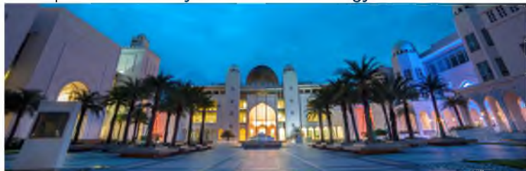
Albukhary International University, Malaysia

The greatest victim of this shift is the study of Islamic knowledge. That today we have relegated the study of religion to separate schools of theology is a result of secular thinking, which aims at separating religion from science in order to protect the latter from “contamination” by the former. In the madrasa, there is no separate school of shari’ah . Why? Because everyone is taught religion and other sciences in an integrated way. The traditional Islamic madrasa system, then, does not correspond with today’s schools of theology but with the ideal