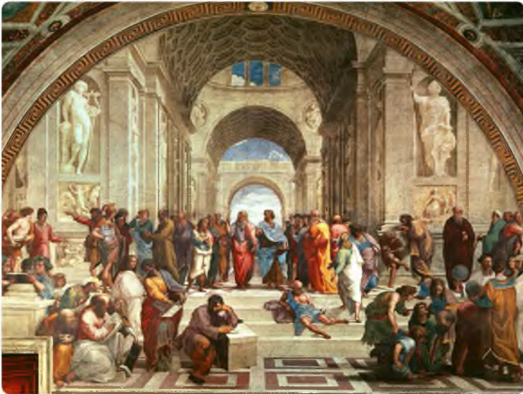
The School of Athens by Raphael (1483-1520)

People ask me also: "What kind of PR are you doing to bring students from different parts of the world?" I respond: