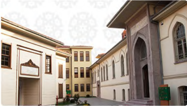
Alliance of Civilizations Institute (ACI)

It gives me great pleasure to address you, dear Ibn Khaldun University (IHU) students – students from all over the world pursuing Masters and Doctorate degrees, studying very exciting topics – and my respected colleagues, Ibn Khaldun University professors from all over the world, offering their valuable knowledge and experience that they have gained over many years. We have brought together bright minds from around the world to produce new ideas to address the