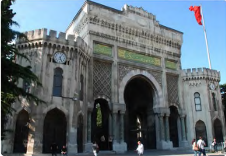
Istanbul University, the oldest continuously functioning university in Turkey, established by Mehmed II the Conqueror in 1453.

Sometimes I ask my students, “What is an idea?” They think that the answer is simple, and that everyone knows what