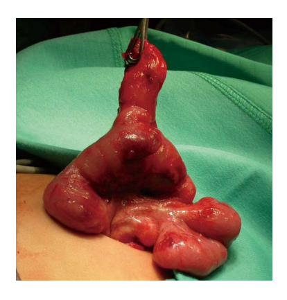
Figure 2 Exteriorization of giant Meckel's diverticulum through the umbilical port.