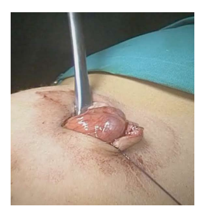
Figure 1 Transumbilical exteriorization of Meckel's diverticulum.