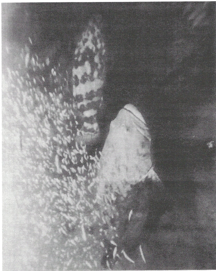
Figure 3. Head on view of the pale color phase of a presumed male Epinephelus itajara (foreground) alongside presumed female (rear) in normal coloration. (Photograph by Doug Perrine, ©1990).