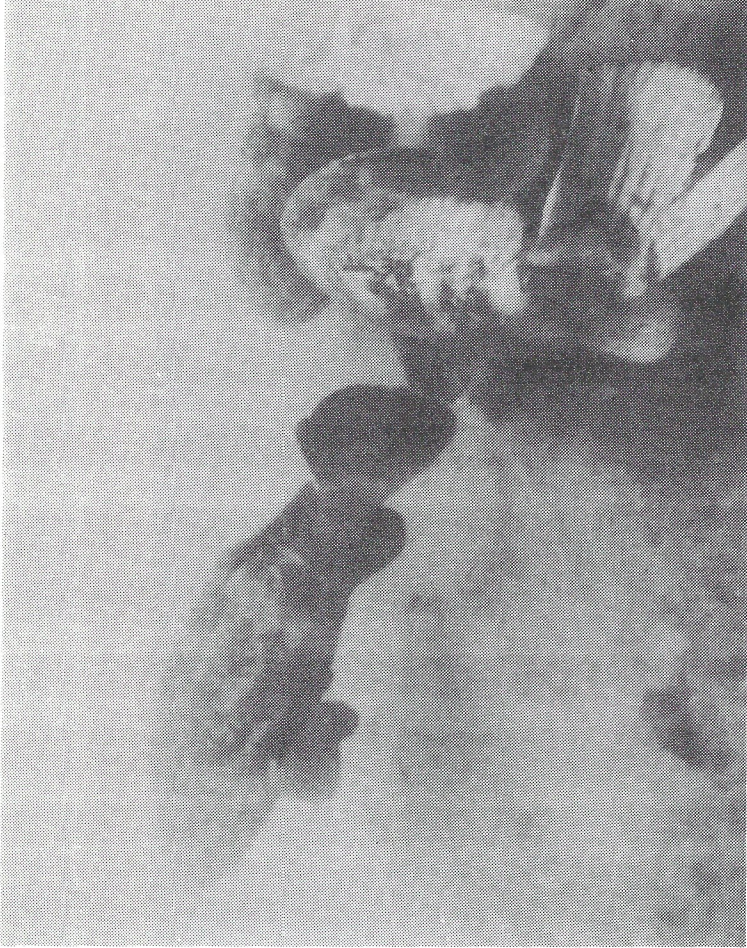
Figure 4. Possible courtship behavior of Epinephelus itajara with presumed male (center) "vent nuzzling" a presumed female (right) while over open sand bottom. A second possible female is to the left of the male.