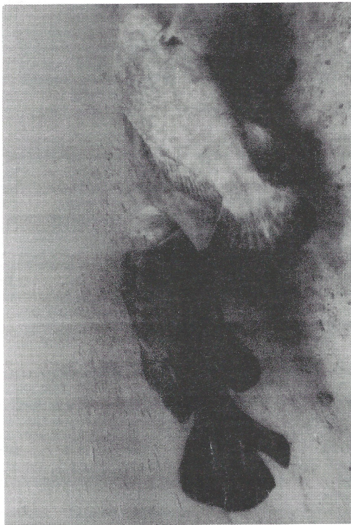
Figure 2. Possible courtship of Epinephelus itajara with a presumed male (left) with pale head and dark body coloration swimming alongside a presumed female (right) in normal coloration.