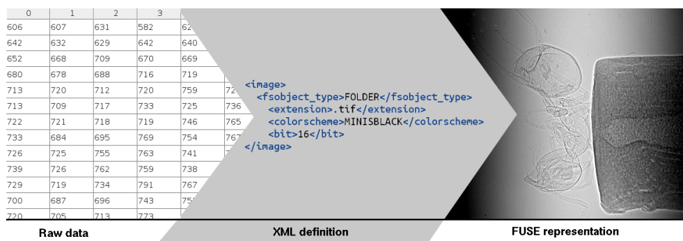
Figure 1: From RAW data to FUSE mounted image.