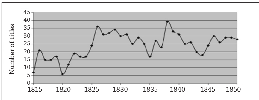
Chart 1. Intensity of book production in Dalmatia (1815–1850)

Although perhaps culturally most developed, with the literary tradition dated back to the age of the Renaissance, Dubrovnik, with its share of 22 percent (198 titles) in the total book production and on average only 5 to 10 titles produced per