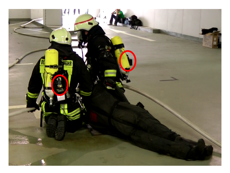
Figure 4. Captured from recordings of firefighter activities during a search and rescue mission. Sensor nodes are placed on the Landmarke transport unit on the air cylinder of the SCBA (encircled in red).

Nevertheless, this single point of attachment also presents a challenge for the recognition of activities and movement abnormalities indicating an emergency. Distinguishing multiple activities from one sensing modality and location is not straightforward. Furthermore, researching a system that accurately recognizes activities of several firefighters is difficult, since the same activity can be performed quite differently by individuals trained in different schools and brigades. Independent of possible improvements of the recognition system, the system will make mistakes. Thus, it is required to evaluate if despite these inaccuracies the system could still be helpful to the IC, a question that is also linked to the presentation of activitity information on the IC device interface.