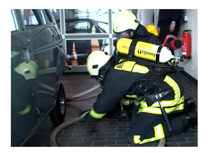
Figure 2. The various water hoses shown in this image caused confusion in the team during a trial mission with occluded breathing masks. The firefighters did not respond to requests of the IC while trying to find out which of the hoses was the right one to follow.

FC: "There is always what is supposed to happen and what actually happens. Normally, every change in the situation should be communicated, every significant piece of information should be told to the incident commander. Except no fire department actually does that, and the Cologne fire department doesn't do that either, because it's just annoying and stressful. He's got a job to do, he has things to do in front of him. It's a job on top of his other tasks, he has to push the button, control his breathing to speak, it limits his actions. And his goal is generally like, well, when it's just a subterranean burn then it doesn't matter, but when he's saving somebody, he just doesn't have the time to talk about what he's doing. They go in there and look for people who are fighting for their lives right now."