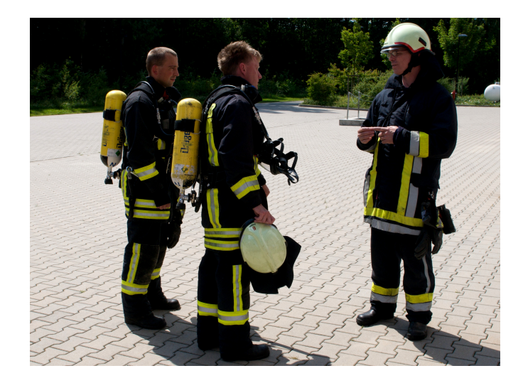
Figure 1. Before the start of a trial mission, the IC instructs the attacking team with exact details on how to approach the scene.

Every member of the attacking team has a specific role that defines his function in the team. One individual is the team leader who is also in charge of communication. The IC remains outside of the building at a safe distance, supervising and coordinating the work of the teams. He is responsible for the safety of the attacking team and receives reports from this team over radio. Regulations in Germany require firefighters to work no longer than 20 minutes before taking a break to recover for at least 30 minutes. As a rule of thumb, it is assumed that a firefighter needs double as much air to retreat back than he needs to reach a point. These rules help the IC to define a time threshold after which he pulls the team out of the IDHL.