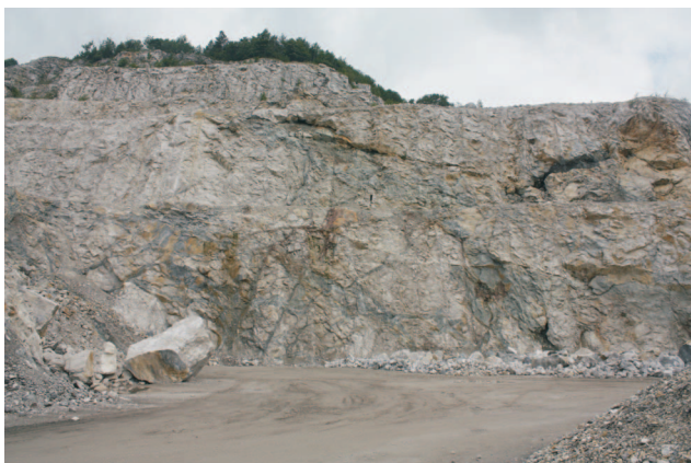
Fig. 2. View of the quarry wall, level 6, Kotouč Quarry near the place of finding the ammonite.