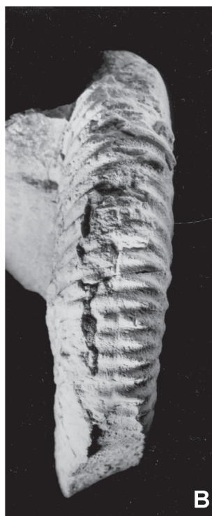
Fig. 4. Lateral view (Fig. A) and ventral view (Fig. B) of Pseudosubplanites grandis (Mazenot). Scale represents 10 mm. (Before taking the photos, the shell was whitened with ammonium chloride. The photographed specimen is deposited in the Regional Museum of National History in Nový Jičín under catalogue number PL 4144.)