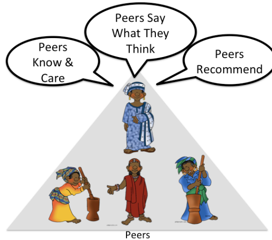
Figure 2: Societal Support

Case (2012) argues that too little research has focused on sharing of information between peers, and the fact that humans often avoid and ignore relevant information. Yet a literature review of peer-related security support does indeed show that many eminent researchers have started looking at this aspect of security. Rader et al. (2012) carried out a study to investigate how non-experts learn about security, and argue for the crucial role of the stories people tell each other in educating people about security. Ashenden & Lawrence (2013) also argue for a social marketing approach to achieve behavioural change, and Lipford & Zurko (2012) argue strongly for a social approach to security. Finally, Camp (2011) argues that usage of security software might have a tipping point, where a herd effect leads to adoption by a group of people.