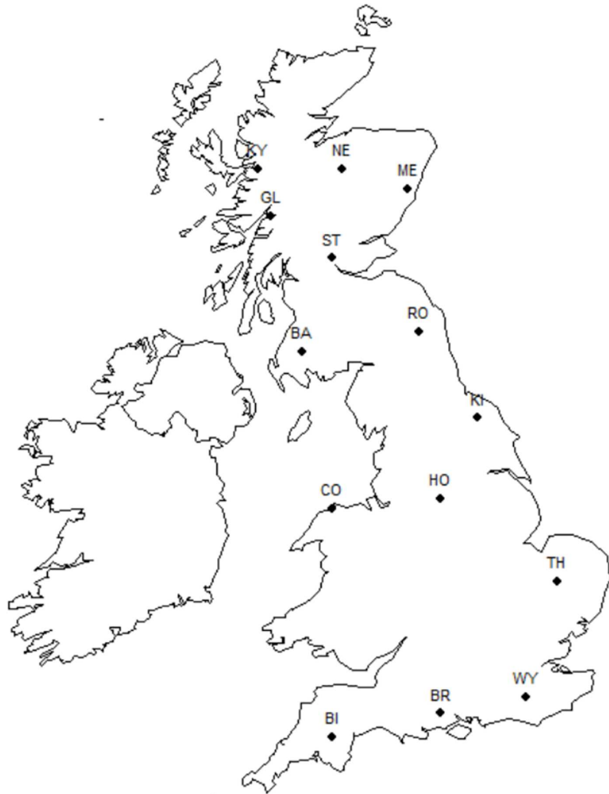
Fig 1. Map of collection sites for lucorum complex individuals.