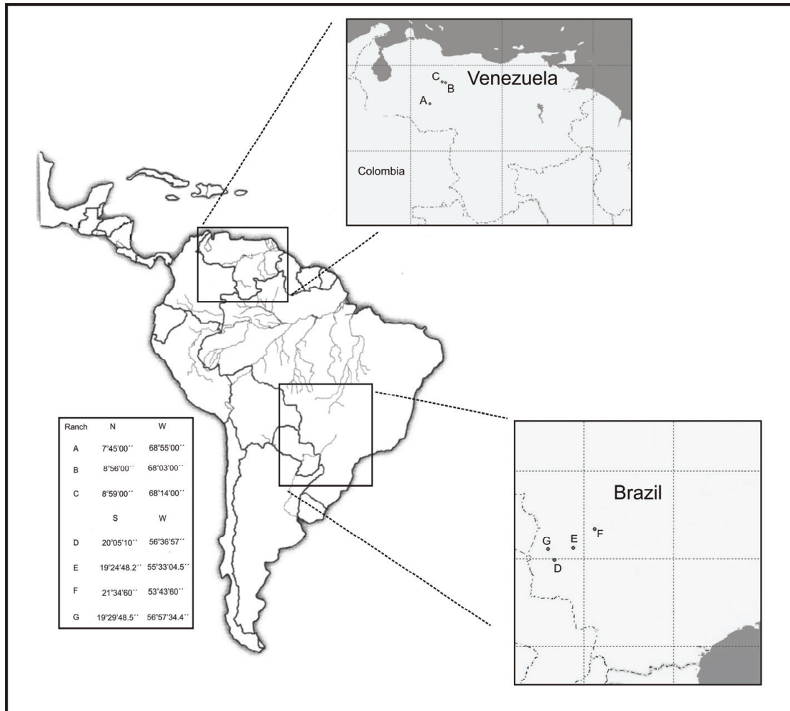
Figure 1. The location of seven privately owned ranches used as case studies (A-G). Each ranch raises livestock, contains a tourism facility, and floods seasonally. Letters A-G correspond to ranches in Tables 1 and 2.

kidnappings. Wildlife have benefited from these private security services, since poachers' access is diminished by the constant surveillance of ranch boundaries by private guards. Because of this protection system, many ranches today support larger populations of wildlife than those found in national parks, where animals have been poached and systematically hunted to extirpation (Silva and Strahl 1995).