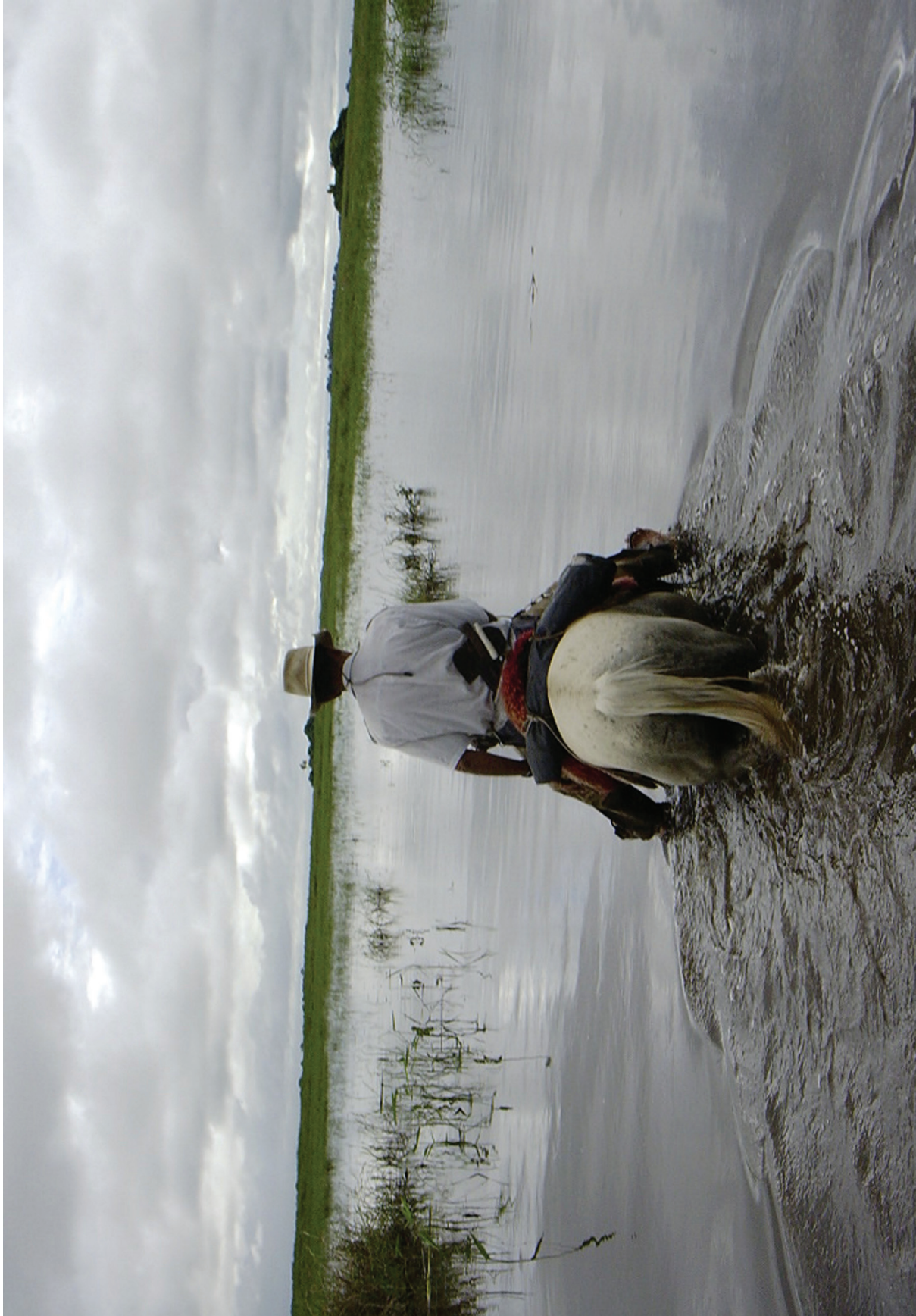
Plate 5. Vaqueiro (horseman) wading through a flooded plain in the Pantanal region, Brazil.