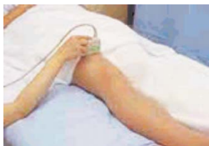
Figure 2 . Leg position

In previous basic methodologic studies on ultrasound measurement 10,19) , subjects stood upright so that measurements could be taken at various points on the body. However, many patients requiring nursing care cannot stand. Consequently, in this study, measurements were taken in the supine position with the legs extended (Figure 2).