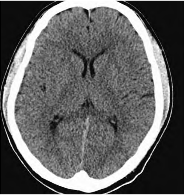
Figure 3 Head computed tomography scan revealed no abnormalities just after termination of the second HBOT session.

certified by manufacturers are widely used in European countries (9). Risk factors for seizures associated with HBOT include hypercapnia (4). In the present case we were forced to supervise the patient without any medical equipment like monitoring devices or syringe pumps. Mechanical monitoring of respiratory rate or capnometer would have prevented the occurrence of seizure in this case. Thus, sufficient medical equipment could be beneficial for the safe and efficient management of patients.