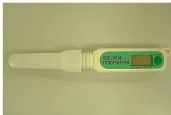
FIGURE 2 Occlusal Force-meter GM10 (Nagano Keiki Co. Ltd., Tokyo, Japan)

biting. The larger measurement achieved on each side was regarded as representative, and the mean value of bilateral representative measurements was used as the MBF of the individual.