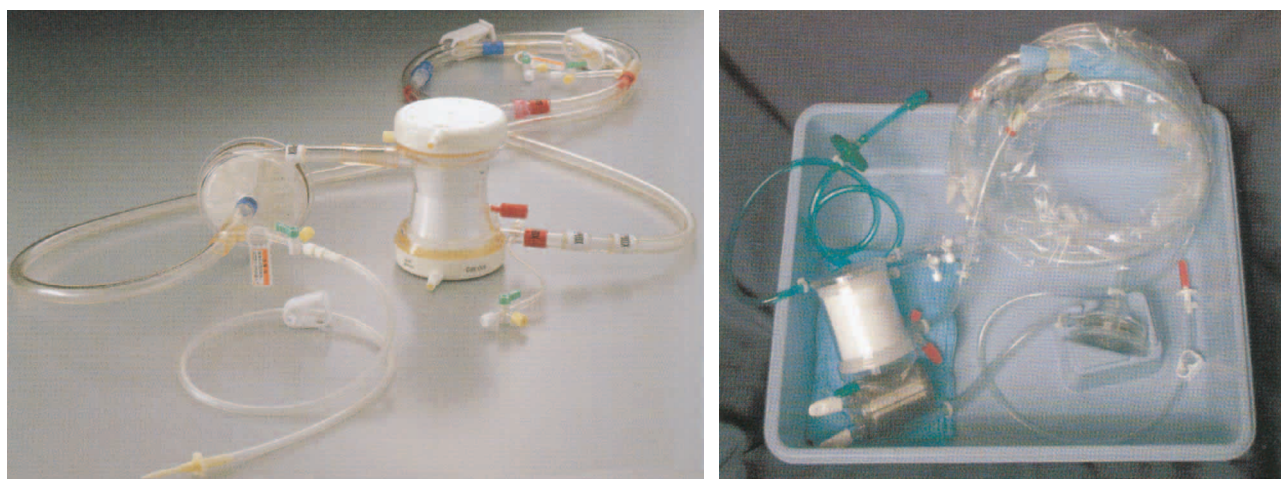
Figure 2. Commercial compact portable bypass systems Left : Capiox ® Emergency Bypass System (EBS) (Terumo Inc., Tokyo, Japan) Right : Carmeda ® Closed Chest Support System (CCSS) (Medtronic Cardiopulmonary Division, Anaheim, CA)

Patients undergoing ECC for non-cardiac appli-