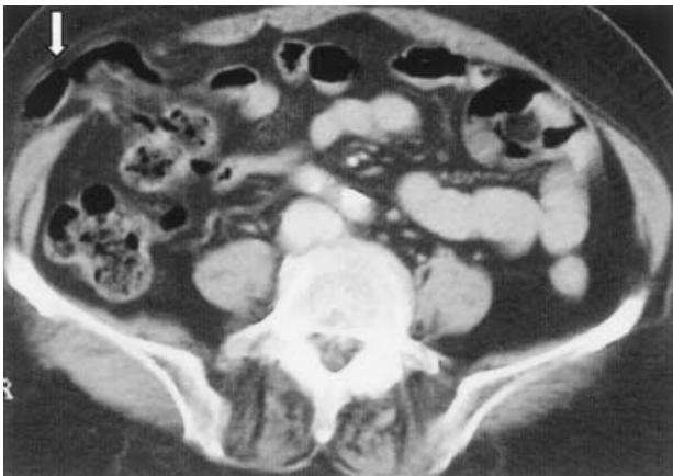
Fig. 1. Findings of abdominal CT. The symbol shows air density, which suggests herniated intestine into the subcutaneous layer.