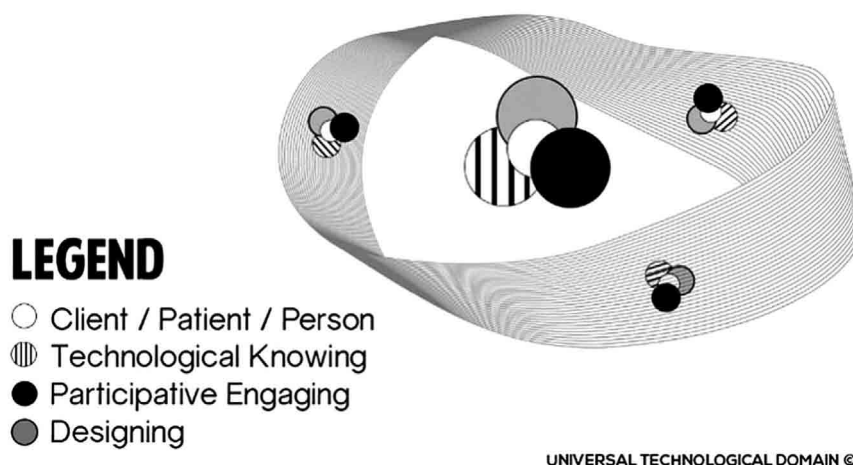
Figure 2. The Universal Technological Domain (UTD)

Since Carper's 12) germinal research was published, nurse scholars have critiqued, extended, and sought to