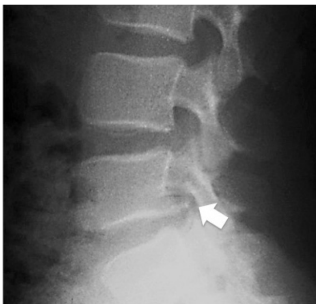
Figure 1 Lateral plain radiograph showing a bony fragment (arrowed) posterior to the upper L4 endplate

Plain radiography revealed a small bony fragment posterior to the upper L4 endplate (Fig. 1). As vertebral bodies were immature in the cartilaginous stage, no ossification was identified at the corner of the vertebral bodies. Magnetic resonance imaging (MRI) showed central protrusion of the L4/5 disc, but the corresponding bony fragment was not clearly