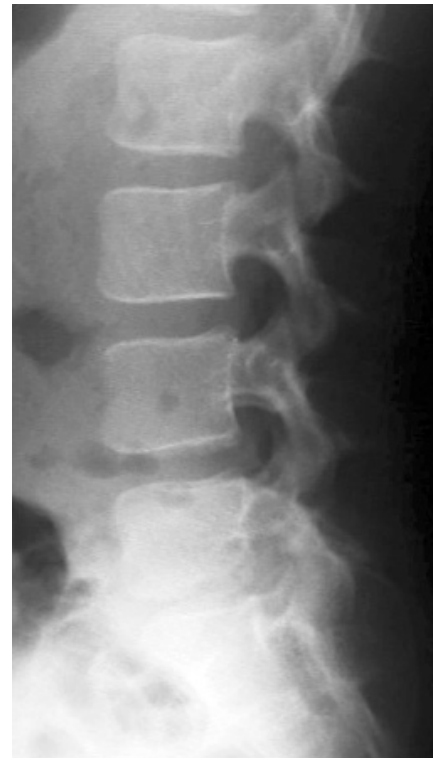
Figure 4 Plain radiograph showing no clear fracture fragment Vertebral bodies are in the cartilaginous stage

nine-month follow up, her tight hamstrings had improved. The FFD was 0 cm and SLRT was negative, but limited to 70 degrees on the right. However, she was unable to achieve sufficient flexibility for figure skating so finally retired from the sport.