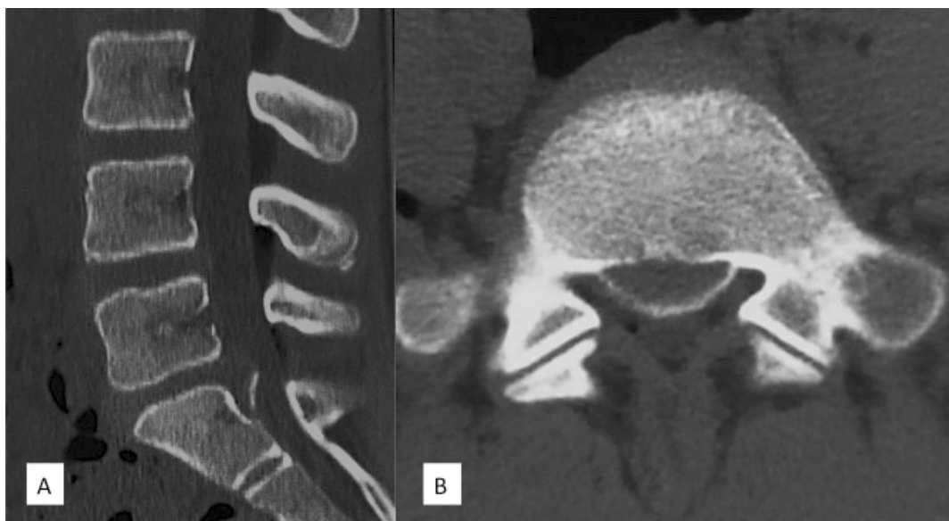
Figure 6 Sagittal (A) and axial (B) reconstructed CT scans showing the fractured apophyseal ring of the superior endplate of S1