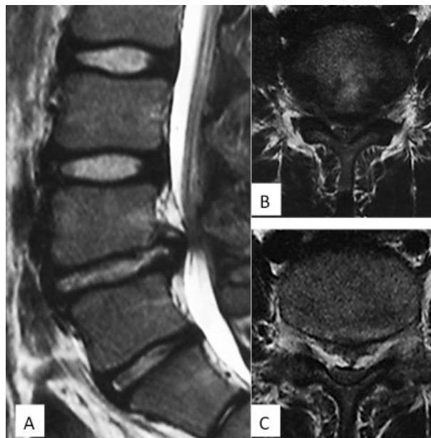
Figure 2 Sagittal (A) and axial T1 (B) and T2 (C)-weighted magnetic resonance image showing degenerative change and protrusion of the L4/5 disc, but no corresponding bony fragment was clearly seen

The patient was successfully managed by conservative treatment, and his LBP and leg pain resolved