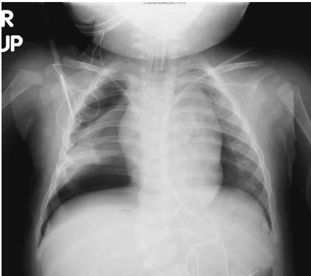
Figure 2. Chest radiograph showing a right pneumothorax.

to 100%. Manual ventilation with high inspiratory pressure and plateau pressure recovered oxygen saturation from 66% to 100%, direct blood pressure from 43/23 to 55/35 mmHg, and R-wave amplitude from 0.1 mV to 0.3 mV within 1-2 minutes (Figure 1 D). Then, the endoscopic surgery was changed to open surgery because of the difficulty of the dissection of the back of the stomach and possible pneumothorax. Hemodynamic stability was attained gradually. R-wave amplitude then recovered but did not reach the preoperative value at the end of the surgery. After the surgery was completed at 8 hours 7 minutes, a portable chest X-ray revealed a pneumothorax on the right side (Figure 2). The pneumothorax recovered after catheters were inserted into the affected area. Eventual postoperative ECG was almost same as the preoperative ECG.