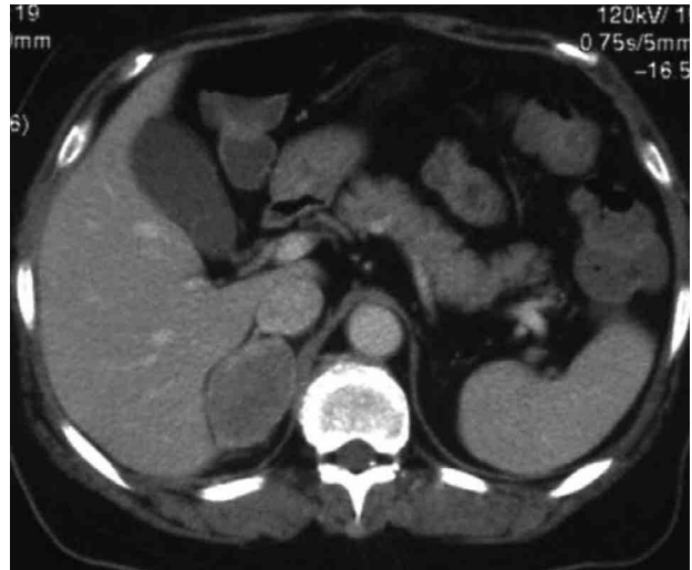
Fig. 2 : CT showing rapid enlargement of the metastatic adrenal tumor, reaching 57 mm in diameter 15 months postoperatively.

had not been present in previous scans. No other sites of metastatic disease were identified. CT performed 1 month later showed a rapidly enlarging adrenal tumor, 57 mm in diameter, indicating metastasis (Fig. 2). Laparoscopic adrenalectomy was performed. Mild adhesions existed between the tumor and liver or inferior vena cava, but the tumor could be successfully removed. Operative time was 3 h 50 min. Pathological examination was consistent with metastasis from the endometrial adenocarcinoma (Fig. 3). The patient was treated with 3 courses of adjuvant chemotherapy using carboplatin and paclitaxel after laparoscopic adrenalectomy. She has now been in good health without recurrence for 5 years and 7 months after laparoscopic surgery.