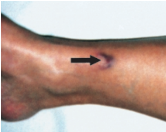
Fig. 1. An erythema around the tick bite region (arrow) in the upper medial malleolar region of right lower limb.

a daily basis and wore socks over the tick as usual. The patient had mistaken it for a blood blister in her words (ecchymoma). On August 19, 1999, the patient visited our department for a course of observation of healing of a duodenal ulcer, and the blood-sucking tick was found when the protrusion-like accretion 'accidentally fell from her skin. Regarding the tick bite, no notable abnormalities including fever or enlargement of the lymph nodes were observed other than a light red semi-ringed erythema measuring 25×15 mm around the tick bite region in the upper region of the right medial malleolus (Fig. 1). The tick was a blood-sucking imago of Haemaphysalis longicornis measuring 10×9 mm (Fig. 2). The head of the tick, which partially re-