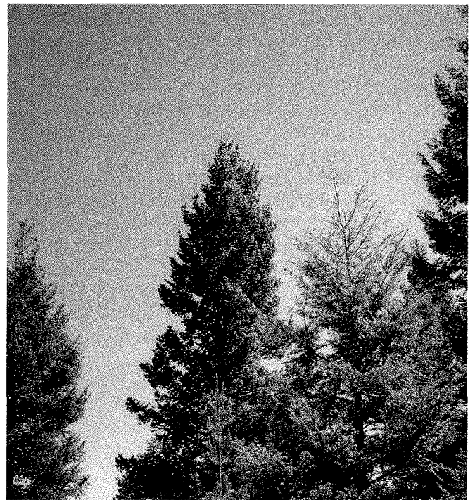
Figure 7-12 —Intermediate Douglas-fir is being top-killed while the overstory remains lightly defoliated (Lubrecht Experimental Forest, western Montana).