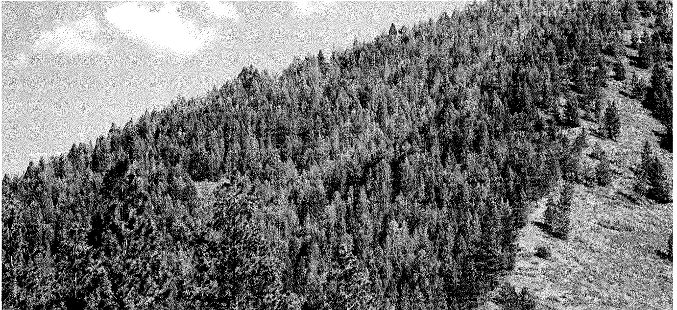
Figure 7-9 —Dense stand of Douglas-fir on the left is more defoliated than the sparse stand on the right. Stand density can override effects of site variations in determining susceptibility (Bitterroot National Forest, southwestern Montana).

Williams and others (1971) observed less damage on relatively open-grown trees than on trees in closed stands in western Montana. They suggested that open-grown trees, even though supporting higher larval populations, could withstand greater stress from defoliation and survive better than trees that must compete for moisture in dense stands. In 10-year-old infested western larch stands in western Montana, Schmidt (1980) found that the percentage of dominant trees with severed terminal leaders decreased as stand density increased when budworm populations were low. The incidence of damage to crop trees, however, was not affected by stand density during the outbreak. The magnitude of the growth release after collapse of the outbreak was greater as stand density decreased. We reason that dense stands would be more vulnerable to damage than lightly stocked stands because they contain more trees or timber volume at risk. MacLean (1980) suggested that the greater the density of preferred host trees in eastern spruce-fir stands, the more vulnerable the stand. On similar sites, dense stands are probably less vigorous than open stands, which also indicates that relative stand vulnerability is greater in dense stands.