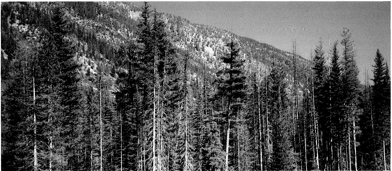
Figure 7-5 —Climax subalpine fir is severely defoliated, while intermingled Engelmann spruce and Douglas-fir receive only slight defoliation (Okanogan National Forest, north-central Washington).