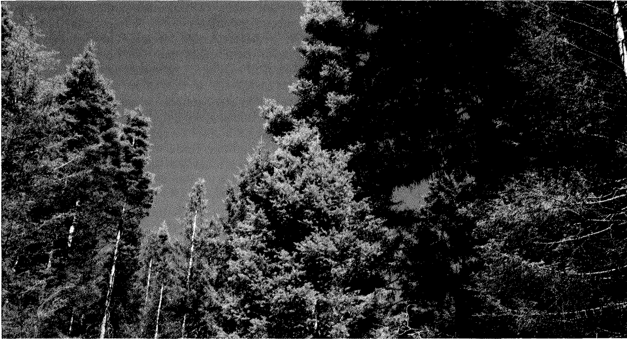
Figure 7-4 —Defoliation on intermediate seral Douglas-fir in foreground is less than on surrounding overstory climax grand fir. Here species is more important in determining tree susceptibility than crown position (Payette National Forest, central Idaho).