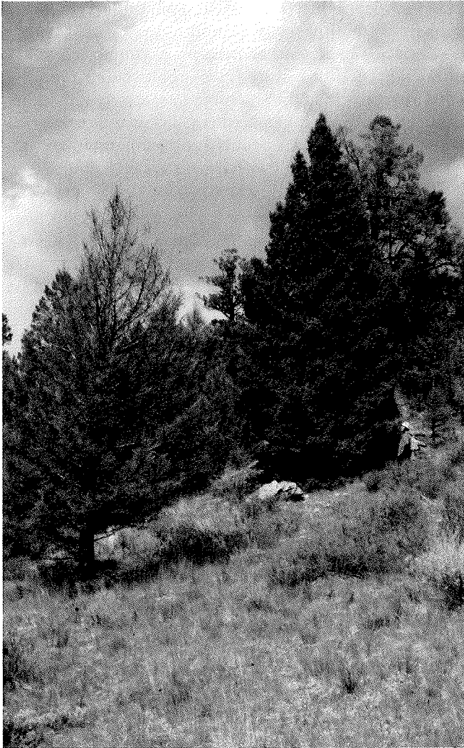
Figure 7-6 —Phenotypic variation in defoliation of two adjacent Douglas-fir trees of similar size and crown position (Deerlodge National Forest, near Boulder, MT).

Budburst phenology is a highly heritable trait and is strongly correlated with budworm success; delayed budburst in Douglas-fir resulted in lower densities of budworm, less defoliation, and smaller females (Cates and others 1983b, Redak and Cates 1984). Although asynchrony between food availability and larval emergence has been shown to be effective for some host species of the eastern budworm, variation in foliage phenology does not explain the variation in apparent susceptibility between red spruce, black spruce, and their hybrids (Manley and Fowler 1969).