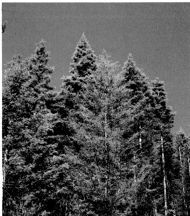
Figure 7-2 —Seral Douglas-fir on the left remains lightly defoliated, while adjacent grand fir on the right suffers severe defoliation (Payette National Forest, central Idaho).