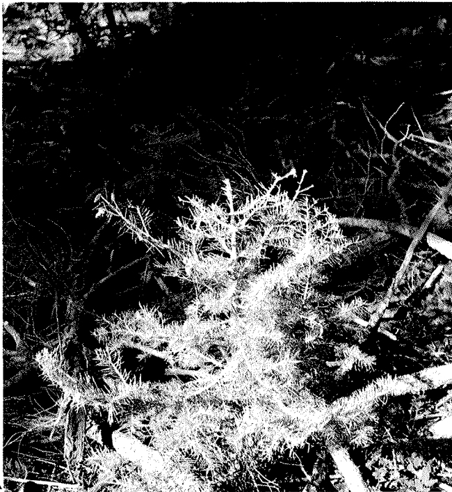
Figure 7-7 —White fir seedling growing in a canopy opening remains vigorous and escapes dispersing budworm larvae (A), while in surrounding dense stands understory white fir is severely defoliated (B). Effects of stand density and vigor override crown position in determining tree susceptibility (Carson National Forest, northern New Mexico).

The vigor of nonhost trees may also affect stand vulnerability. The growth of ponderosa pine sometimes accelerates in response to defoliation of competing Douglas-fir (Carlson and McCaughey 1982). Overmature or suppressed nonhost trees may not release when competition is reduced by the defoliation or death of neighboring host trees. Vigorous nonhost trees that are competing with host trees, however, can release quickly during infestations and will, at least partially, compensate for the growth decline in the host component.