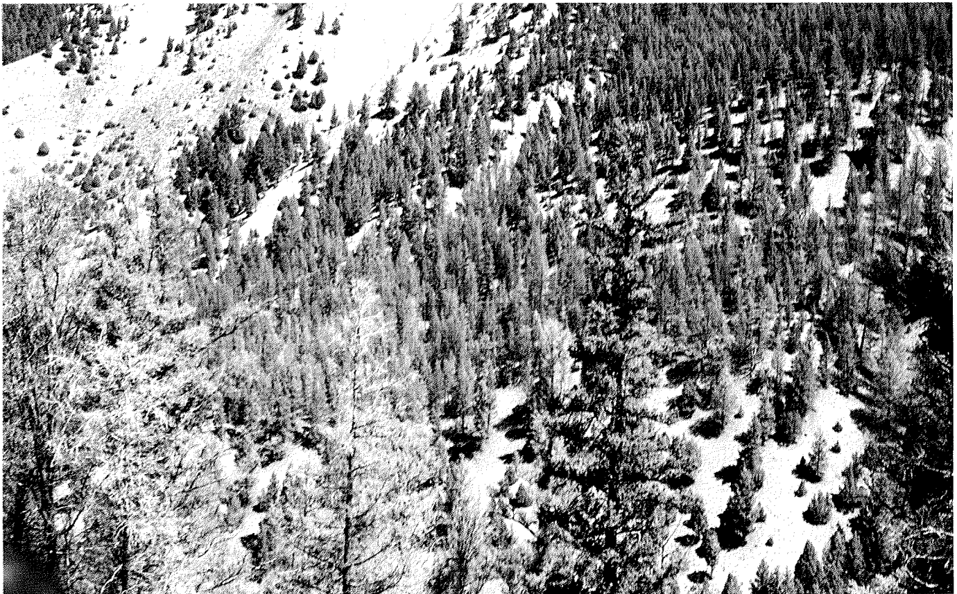
Figure 7-1 —Severe defoliation and tree mortality occurs on steep, dry sites—which are marginal for timber production (Gallatin Canyon, south-central Montana).

overwintering stage is entered before the onset of cold temperatures in the fall. Blais (1958) observed that cooler than average temperatures were, in part, responsible for the delayed development of eastern budworm larvae at higher elevations. As a result, pupae often failed to give rise to moths, some eggs failed to hatch, and many first instars were killed by cold weather in the fall. Thomson (1979) estimated that western budworm eggs will not hatch if the temperature is below 60 °F (15.6 °C) or the relative humidity is below 50 percent or above 75 percent. Warm, dry summer weather promotes mating of eastern budworm (Greenbank 1963a) and could have a similar effect on western budworm. Extended larval and pupal development under cool regimes would presumably allow predators more time to find and destroy them. Late spring frosts can decimate populations of exposed budworm larvae or result in starvation if the expanding foliage of host trees is killed (Fellin and Schmidt 1973a, Johnson and Denton 1975, McKnight 1971).