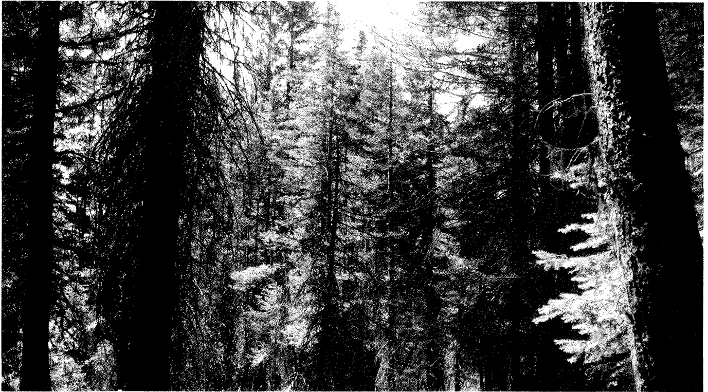
Figure 7-10 —Subordinate host trees in an uneven-aged stand intercept dispersing budworm larvae and become severely defoliated (Payette National Forest, central Idaho).