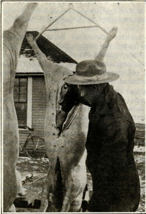
Fig. 2.—Showing proper way of splitting hog. (No danger of cutting fingers or intestines.)

the animal's body, holding it by its front legs. The one doing the sticking puts his hand firmly on the hog's chin and pushes it toward the ground. The knife is taken in the other hand, care being exercised to keep the edge down throughout the operation. A slit is made just in front of the breast bone. The knife is then pushed toward the backbone, allowing the point to project slightly under the breast bone, with the point of the knife cut forward. The depth of the thrust will have to be determined by the size of the hog; for a 225-pound hog not all of the blade of a 6-inch skinning knife will be necessary. While there is little danger of sticking the hog in the shoulder if a skinning knife is used, the animal should be held squarely on his back at all times and the knife should always be kept parallel with the backbone (no attempt should be made to cut crosswise.) It is undesirable to stick the heart; if the muscular action is interfered with the heart stops beating and does not force the blood from the smaller veins which should be thoroughly drained.