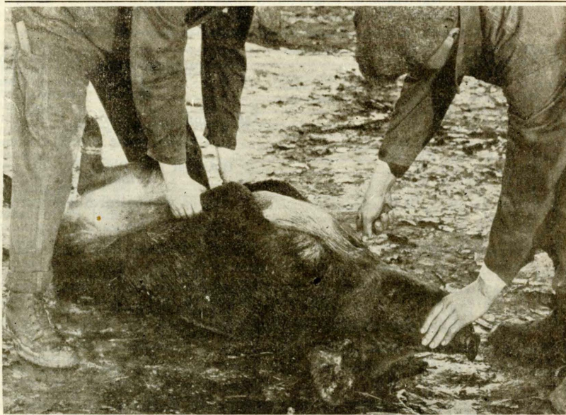
Fig. 1.—Showing proper method of sticking, which is easy and humane as well as insuring a good bleed.

Agricultural Experiment Station Utah State Agricultural College