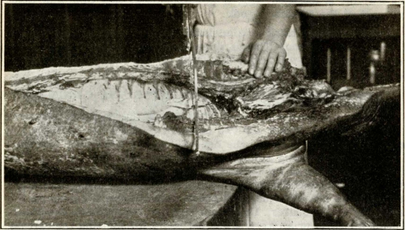
Fig. 4.—Showing shoulder cut between third and fourth ribs.

trimmed off and used for lard. At least \frac{1}{4} inch of fat should remain on the piece.