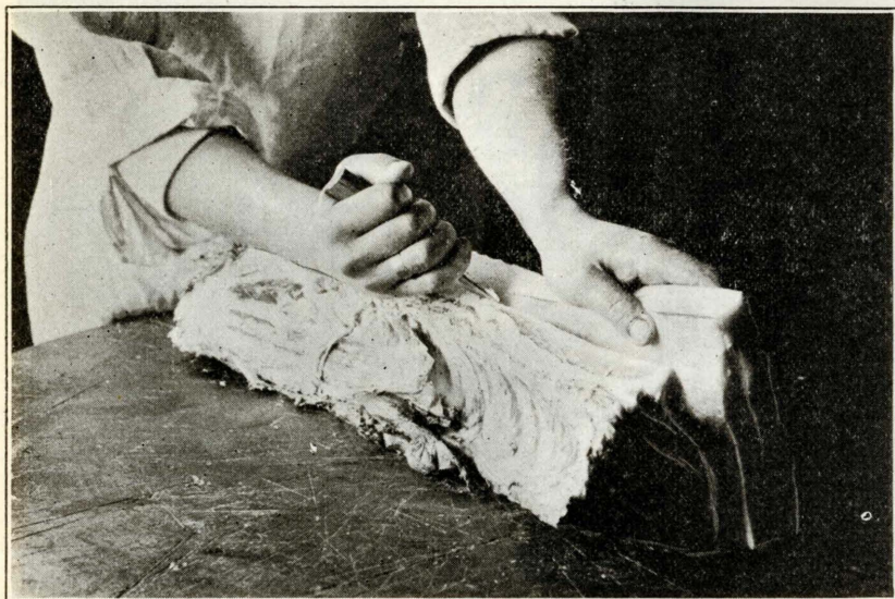
Fig. 6.—Taking off the fat back

Inquiry leads one to believe that much more meat is consumed on Utah farms than is cured or even produced there. Many farmers follow the practice of selling on the market all the animals which they produce. The meat which they eat they buy locally, usually at prices which seem high when compared to the cost of production. If each farmer were to cure his own meat he would have available at all times, at a cost which would not be prohibitive, a supply of one of the most important food products.