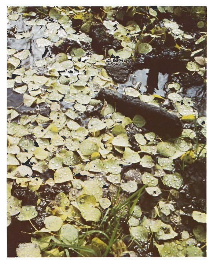
Figure 5.—In some cases, aspen leaf fall may smother newly germinated conifer seedlings.

As noted in the FORAGE chapter, the herbaceous layer under aspen is usually described as heavy, approaching or exceeding that in meadows (Ellison and Houston 1958, Paulsen 1969, Pearson 1914). This herbaceous cover removes water from the soil and also shades conifer seedlings. Like aspen leaves, it buries seedlings temporarily in autumn, when the dead herbs are packed down by snow. Tucker et al (1968) reported burial by dead herbs as a cause of seedling deaths in