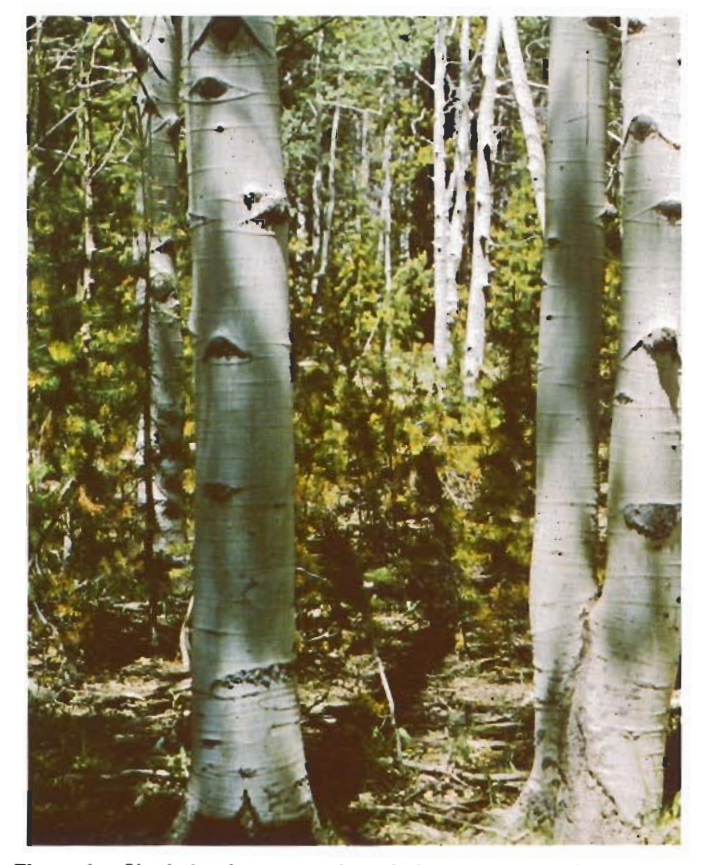
Figure 4.—Shade intolerant species—lodgepole pine in this case are suppressed under aspen.

From the subarctic to the tropics, soil surface temperatures in the open reach 120-160^{\circ}F (49–71°C) on clear summer days. They are higher with decreasing latitude and with increasing elevation (Jen-hu-Chang 1958). Noble and Alexander (1977) recorded soil surface temperatures higher than 140^{\circ}F (60°C) on mineral soil seedbeds, in a spruce-fir forest clearcut, at 10,600 feet (3,250 m) elevation. In contrast to bare sites, surface temperatures beneath aspen canopies in Russia gener-