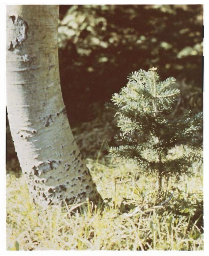
Figure 2.—Aspen provides essential shade and favorable climate for the establishment of more shade tolerant conifer species.

In Arizona and New Mexico, Pearson (1914) noted that, on burned areas above 8,000 feet (2,450 m), Douglas-fir, white fir, and Engelmann spruce thrived in the shade of aspen. In contrast, coniferous reproduction usually was sparse on burned areas occupied by neither aspen nor oak. In the subalpine zone, Engelmann spruce nearly always reproduced well under an aspen over-