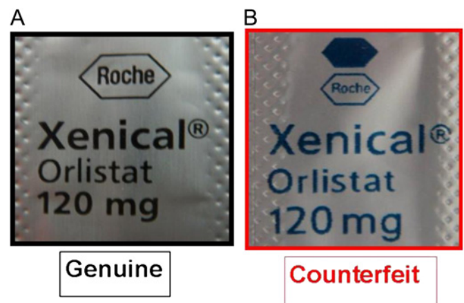
Figure 3 Reverse side of blister: (A) logo of genuine sample and (B) logo of counterfeit sample.