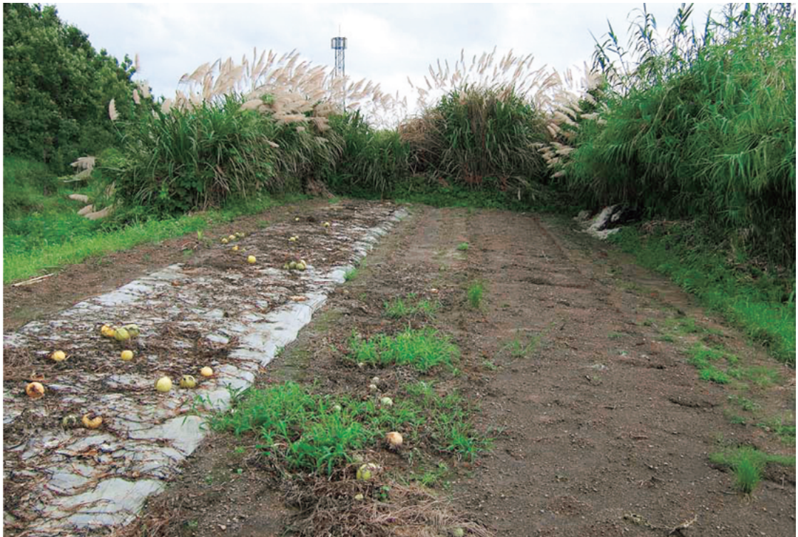
Fig. 2. Miscanthus floridulus used as protection around a crop field (photo: Tarumizu-shi, Kagoshima Prefecture; July 09, 2005).

sample number =55, average seed fertility:62%