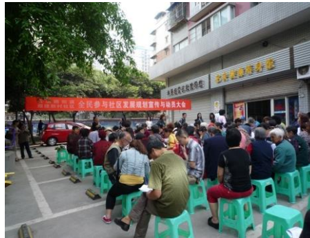
Figure 5: The pep rally of Meijianxincun during Shiyoulu sub-district community development planning.