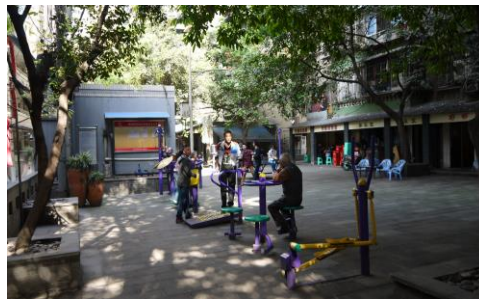
Figure 2: The central square of Dajingxiang after the spatial environmental improvement