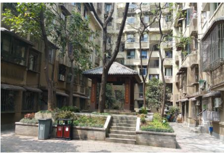
Figure 1: The central garden of Jialingqiaoxicun after the spatial environmental improvement