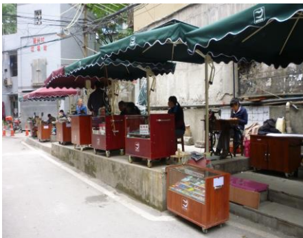
Figure 4: The mobile stalls—city sights on the go.