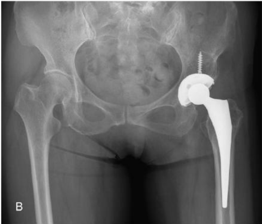
Fig. 3. (A) Preoperative anteroposterior radiograph of a 68-year-old woman with left arthrodesed hip and (B) postoperative radiograph at 1-year follow-up.