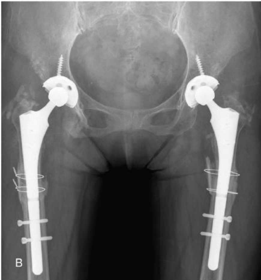
Fig. 4. A 70-year-old woman with bilateral severe dislocated hip. Preoperative (A) and postoperative (B) anteroposterior radiographs at 8- (right) and 7-month (left) follow-up.