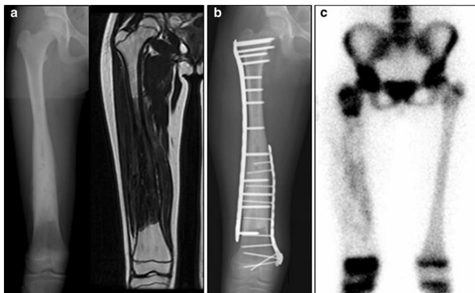
Fig. 3 A 13-year-old girl with osteosarcoma of the right femur (case 19). a Pretreatment radiograph and magnetic resonance image showing osteosarcoma of the right femur. b Postoperative radiograph; osteotomy was performed on the proximal side of the tumor site, and PFP was used for the reconstruction. c Bone scan at 1 month after reconstruction showing the uptake in the frozen bone

treated before 2002 (cases 1 and 3), we performed the FFP; however, at present, we would prefer to treat such cases using the PFP.