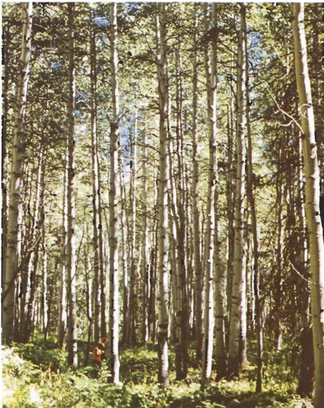
Figure 1.—Many existing aspen stands in the West are at or beyond rotation age.

In the West, however, most markets have been for larger logs (sawlogs and veneer logs), and the situation is complicated by the frequency of two-aged and uneven-aged stands. Also, most aspen in the West lives longer and grows more slowly than aspen in the Lake States (fig. 1). For management purposes, only even-aged stands are considered here; it is the only aspen stand structure suitable to manage for wood products.