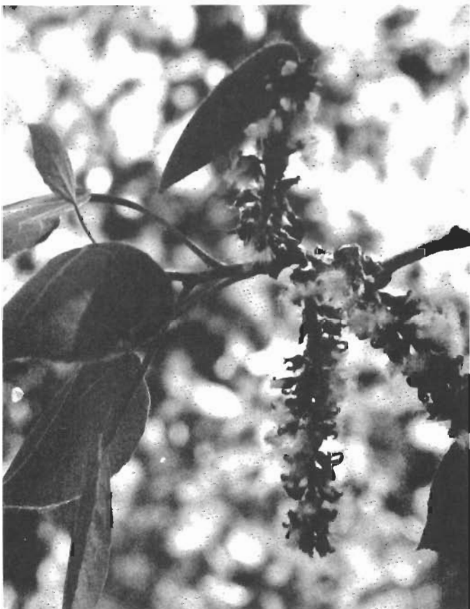
Figure 1.—Maturing pistillate catkins. Aspen woodland in mid-June at 7,200 feet (2,200 m) elevation on the Wasatch National Forest of northern Utah.

These events are completed during a 4- to 6-week interval. The strings of capsules (catkins) developed from the ovaries of pistillate flowers open along two slits. The tufted seeds are exposed to wind for dispersal over a wide area (fig. 1). Meanwhile, other reproductive buds