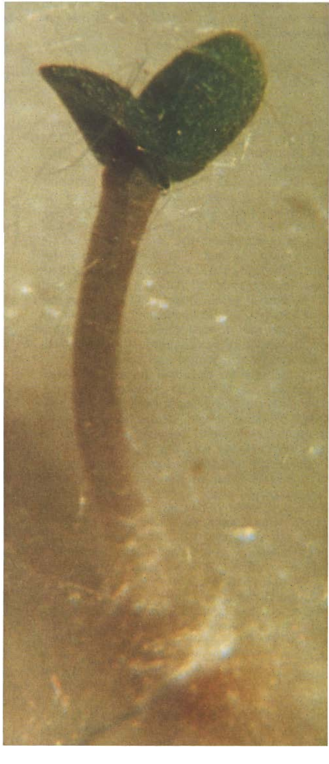
Figure 2.—Germination of an aspen seed: (1) incipient germination, (2) initial root protrusion, (3) initiation of root hairs, (4) elongation and curvature of the root-hypocotyl axis, (5) an "S"-shaped axis and development of chlorophyll in the cotyledons, and (6) unfolding of the cotyledons and extensive growth of the hypocotyl.