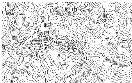
Textfigure 2. Map showing the locality in Morimoto-machi. (Topographical Map, Scale 1/25,000 : Fukumitsu sheet)

Locality : Road-side cutting and valley side exposure at about 400 meters SEE from Wakihara village, Morimoto-machi, Kahoku-gun, Ishikawa Prefecture.** Lat. 36^{\circ} 34' 42'' N.; Long. 136^{\circ} 46' 55''.4 E. (Textfigure 2).