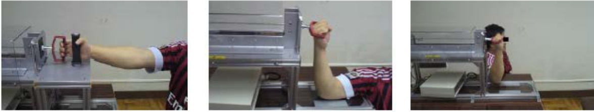
Fig. 2 Measurement procedures

(From left; handgrip, elbow flexion, and shoulder internal rotation)