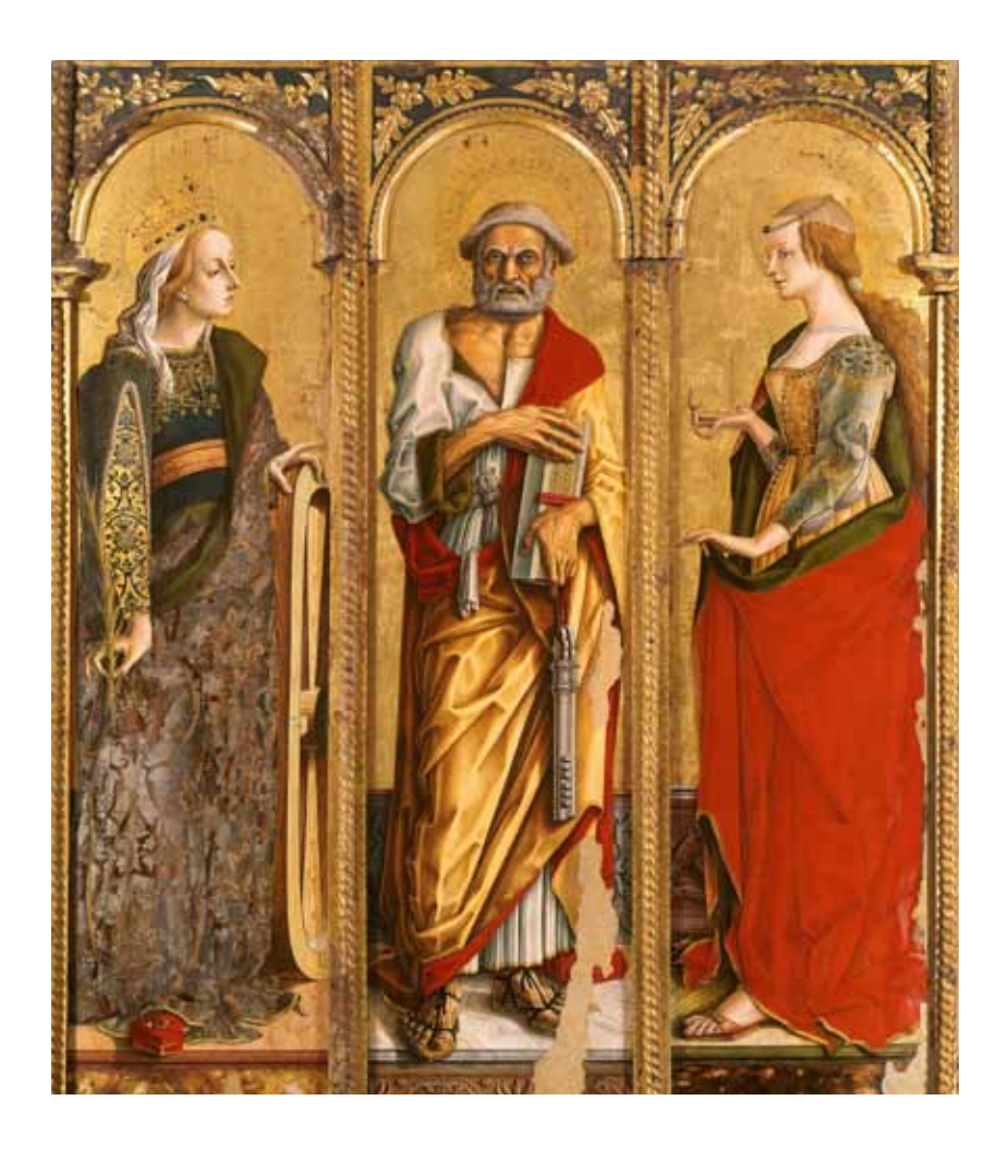
FIG. 9 Carlo Crivelli Three panels from the altarpiece of S. Francesco, Montefiore dell'Aso, c. 1471–73 On panel, 174 × 54 cm S. Lucia, Montefiore dell' Aso

encouraged to shuttle from figure to ground and back again, and in the process ornament-as-ground and ornament-as-attribute begin to resemble one another. Such is the case with the shape described by St. Emidius's halo overlaid on his pointed miter (fig. 7) when seen next to the similarly contoured pattern of his brocade ground with its crowning ogee. The juxtaposition offers a kind of decorously sanctioned distraction. This is not an isolated effect. A similar kind of play between attributes and ornaments appears, for example, in the St. Stephen panel (fig. 8) from the upper tier of the high altarpiece for S. Domenico at Ascoli, where three stones of Stephen's martyrdom clearly mimic, in their neat array around his head, the triple clusters of projecting gold balls on his dalmatic, enchanting the viewer almost as strongly as the saint's gaze. 16 That Crivelli's ornaments are not merely eye-catching but truly systematic becomes still more obvious when we compare the Ascoli high altar with the near-contemporary polyptych (fig. 9 recomposes some of its panels) made for the Franciscans in Montefiore dell'Aso. Here, in line with the ideals of the Friars Minor, the brocaded grounds are withdrawn, haloes are simply inscribed rather than built up in relief, and the whole rich paraphernalia of