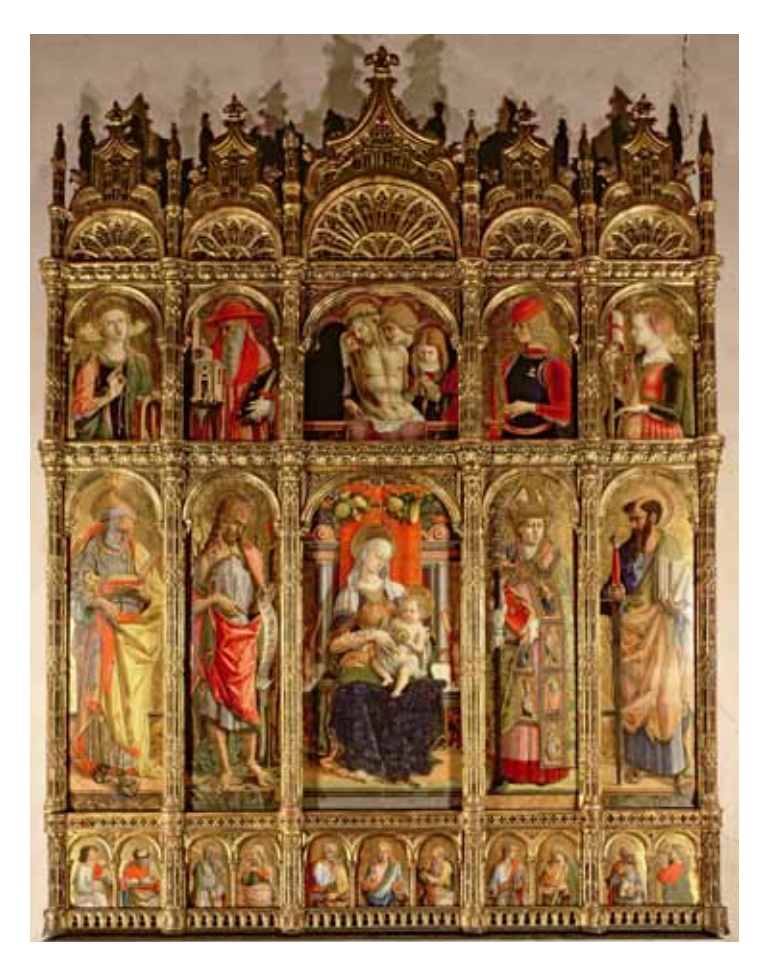
FIG. 5 Antonio Vivarini and Giovanni d'Alemagna The altarpiece of the Virgin, c. 1443 On panel Chapel of St. Tarasio, S. Zaccaria, Venice