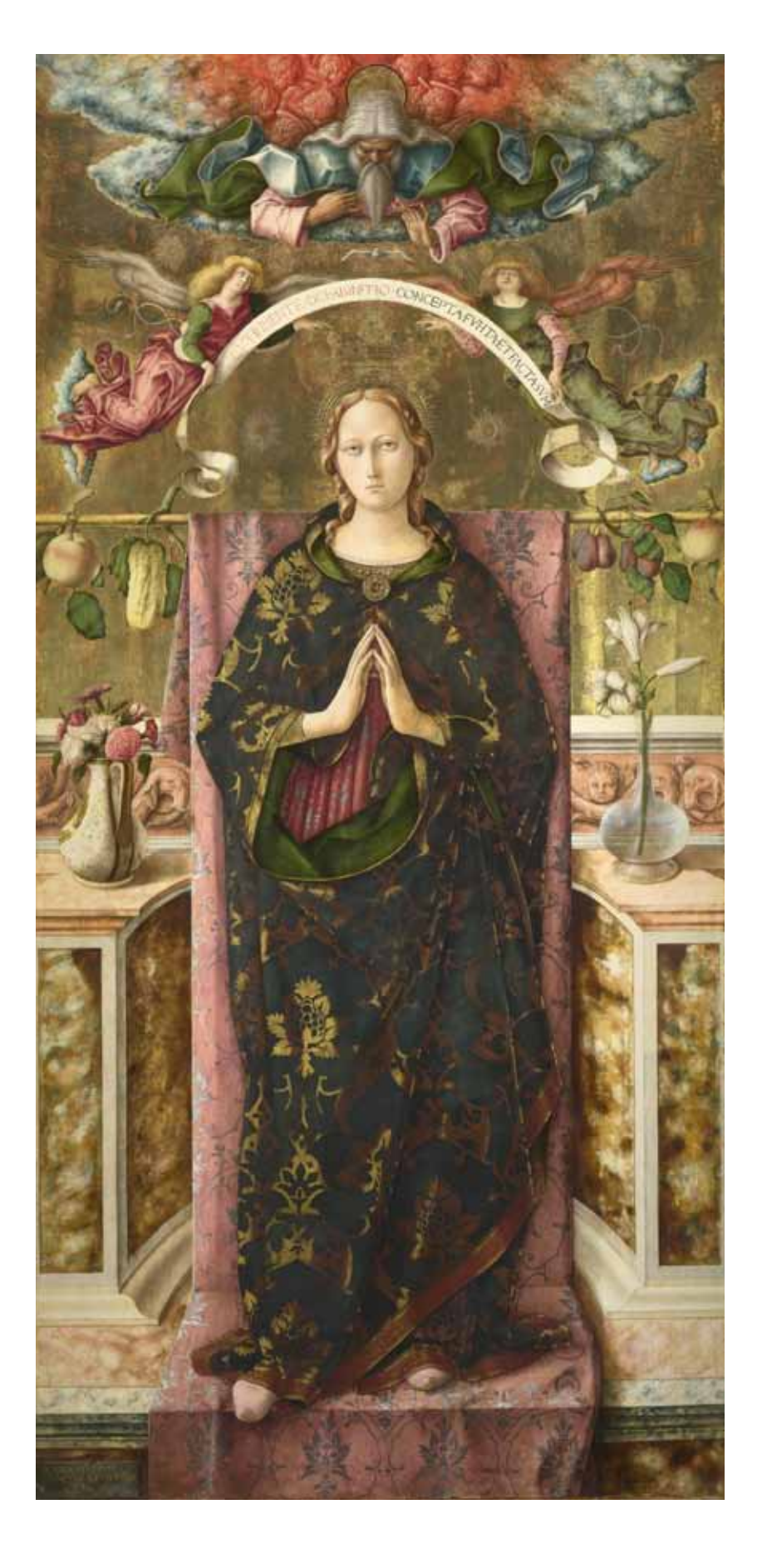
FIG. 17 Carlo Crivelli The Virgin of the Immaculate Conception, from S. Francesco, Pergola, 1492 On panel, 194.3 × 93.3 cm The National Gallery, London