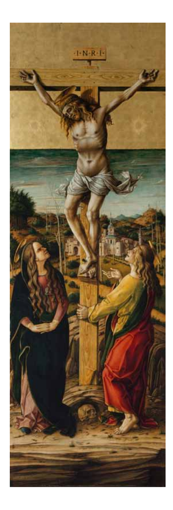
FIG. 1 Carlo Crivelli The Crucifixion, probably later 1480s On panel, 218 × 75 cm Pinacoteca di Brera, Milan

stationed below it raises her eyes, something exceptional occurs: well above the horizon, and halfway up Christ's body, the pictorial ground proposed in the lower part is suddenly ruptured and the field cuts, literally, to a heavenly locus that is apocalyptic and for all time. The visual shock of this theophany is that there is no transition. Instead, the gold ground, seen from below, animates in a flash of reflected light, etched with the symbolic Sun and Moon. Even as Christ's body, as in a sculpture, casts a shadow on the grainy wood of the cross, the cross itself appears lit by a different source. The message is stunningly plain—Christ's incarnate and sacrificed body on the cross is the devotee's bridge between earth and heaven, time and all-time; the Crucifixus is at once grounded in death and eternally exalted. The gold ground is therefore revealed not as a matter of taste, at least not here, but as a decision to see the cielo (in Italian, both sky and heaven) from a transcendent nonperspective of the heavenly.