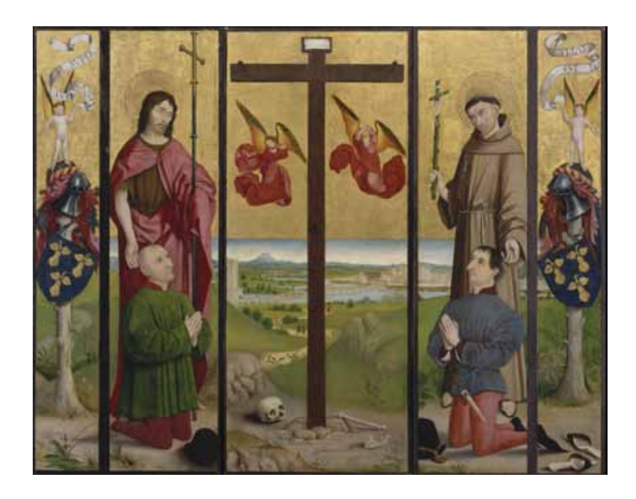
FIG. 2 Circle of Nicolas Froment The Pérussis altarpiece, c. 1480 On panel, three panels each 138.4 × 58.4 cm The Metropolitan Museum of Art, New York