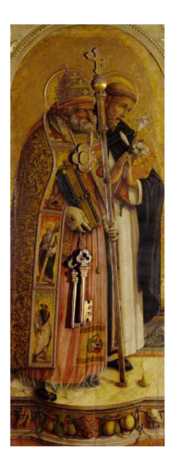
FIGS. 13, 14 Carlo Crivelli Sts. Peter and Dominic s from the S. Domenico, Camerino, polyptych, and detail of St. Peter, 1482 On panel, 167 × 63 cm