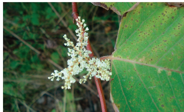
Figure 5. Reynoutria spp. inflorescence (orig.). Slika 5. Cvast Reynoutria spp.