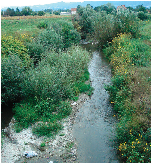
Figure 1. River Čemernica as a potential invasion corridor (orig.). Slika 1. Reka Čemernica kao potencijalni koridor invazije.