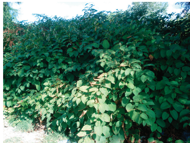
Figure 4. Large stand of Reynoutria spp. on the banks of Zapadna Morava (orig.). Slika 4. Velika sastojina Reynoutria spp. na obali Zapadne Morave.