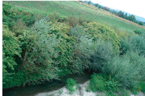
Figure 2. Reynoutria spp. encroaching on riverbank's native vegetation (orig.). Slika 2. Reynoutria spp. potiskuje nativnu vegetaciju rečne obale.