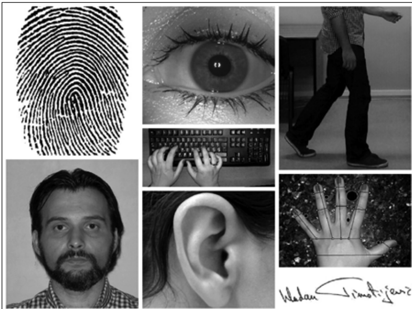
Figure 1. Examples of biometric characteristics: fingerprint, iris, keystroke dynamics, gait, face, ear, hand geometry and signature

Biometrics represents automatic methods for human recognition based on their quantifiable biological characteristics, which can be anatomical (e.g. fingerprint, face, iris), physiological (e.g. heartbeat, brainwaves) and behavioral (e.g. voice, handwriting, gait) (Figure 1). The success of a biological characteristic as a reliable and accurate identifier has been defined by seven parameters: universality (trait exists in all individuals in a population), uniqueness (trait sufficiently differs among individuals), permeance (trait is sufficiently constant over time), measurability (trait can be collected, digitalized and further processed), performance (recognition accuracy), acceptability (agreement of individuals being recognized to present the trait) and circumvention (ease of trait forgery). 5 While none of the biological traits score ideally on all seven criteria, nature and requirements of a specific application will dictate the importance of each factor. For instance, if biometric identification is used to restrict access to air traffic control towers to authorized personnel only, low circumvention will have more weight compared to high acceptability in the process of choosing an appropriate biometric trait for this specific application.