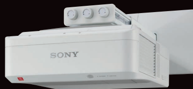
VPL-SW535 ( WXGA ) & VPL-SX535 ( XGA )

For more information, please call 1300 881 909 or visit our website.