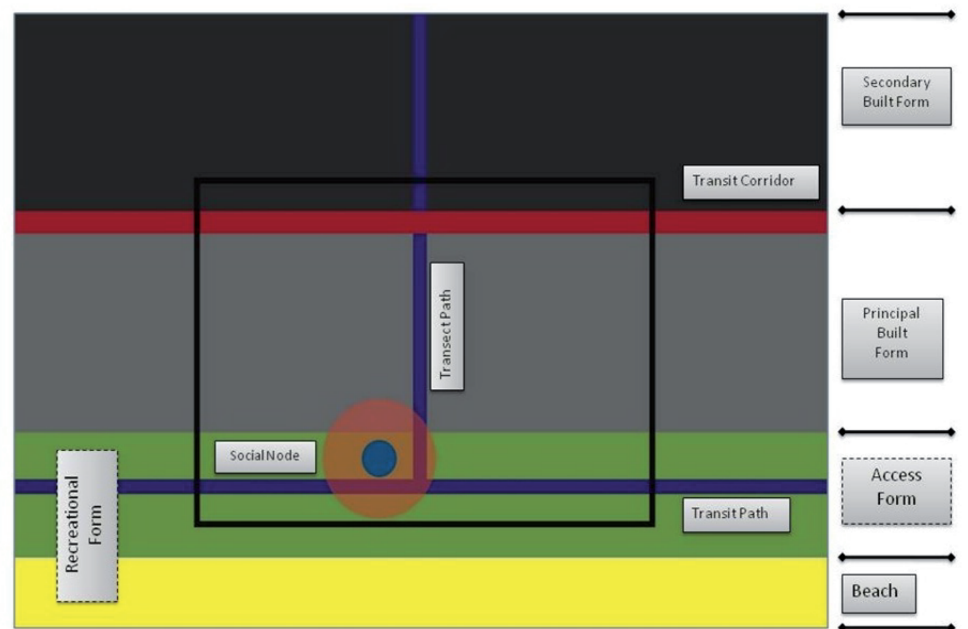
Diagram illustrating the typological model of Gold Coast beach precincts