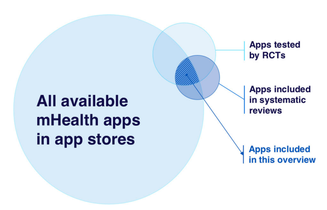
Fig. 2 Scope of the overview

of our study. Due to lack of established data on each category, the circle sizes and overlaps are illustrative.