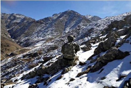
1 Joint Public Affairs Unit - Achieves