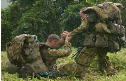
1 Joint Public Affairs Unit - Achieves