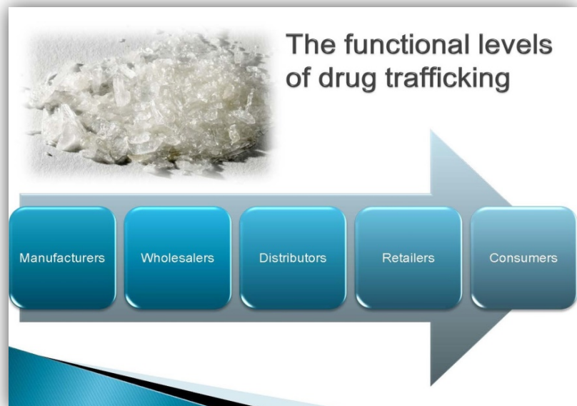
Figure 1: Functional levels of drug trafficking (Abadinsky, 2013)

The ACC report indicates that transnational organised crime involvement in high-volume precursor importation and trafficking remains at high levels (Australian Crime Commission, 2015a). Concern about illicit importations concealed by legitimate markets is clear, particularly from a law enforcement perspective.