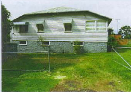
The house in Lavelle Street Nerang