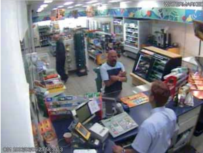
The suspect was captured on video inside a petrol station