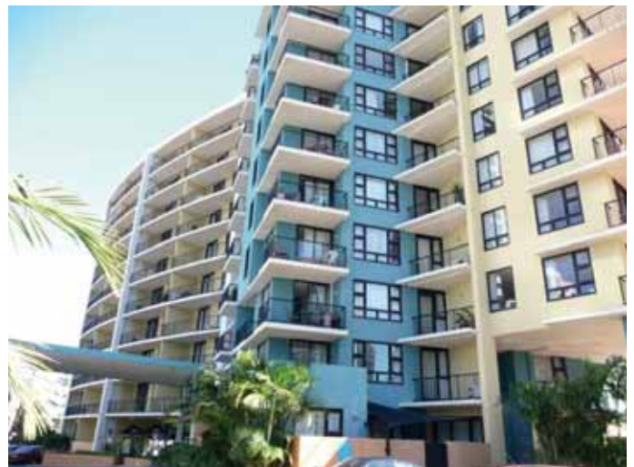
Neptune's Apartments in Broadbeach, Queensland