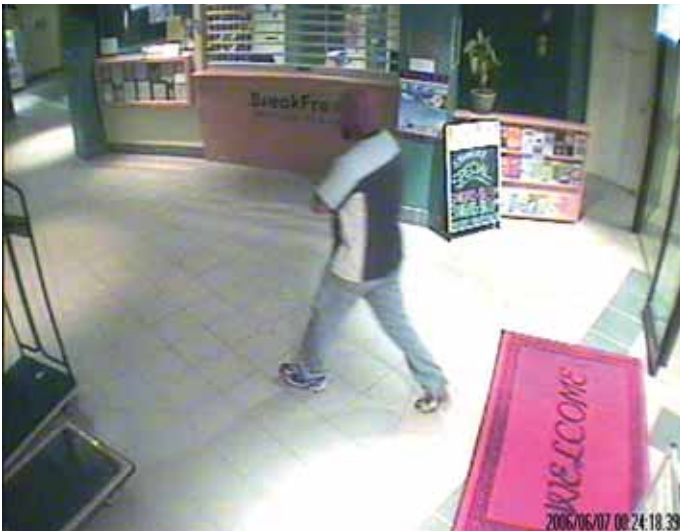
Surveillance vision shows this male entering the Neptune's Apartment complex at 12:24am