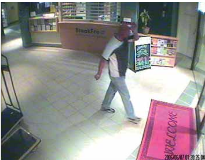
The same male is recorded walking toward the entry/exit door of the premises at 1:20am

we sought assistance from the State Emergency Service and a search of the surrounding grounds was made in an attempt to find any evidence of the crime, in particular, a murder weapon. Unfortunately the search failed to reveal anything of any significance. A doorknock of the 7th, 8th and 9th floors revealed a number of witnesses from apartments either directly below or next to apartment 803 who had heard banging noises. One witness also heard a woman screaming for a number of seconds.