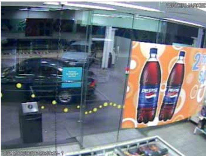
Video surveillance of the petrol station frontage